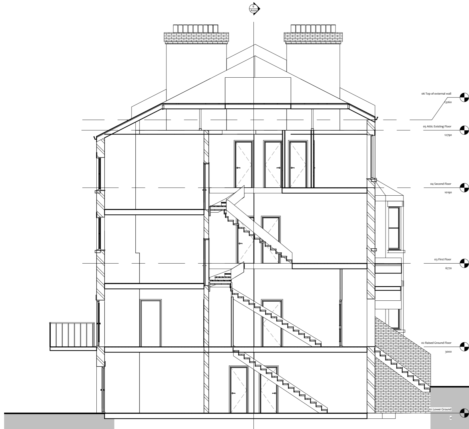
Section 1 1 : 100