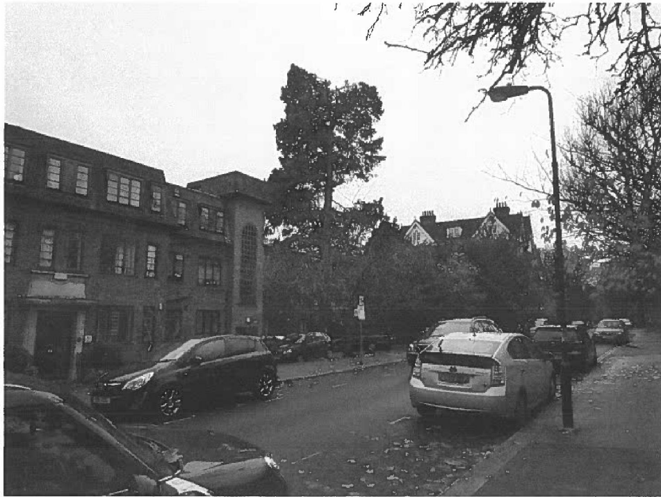
View of the tree from Wedderburn Road