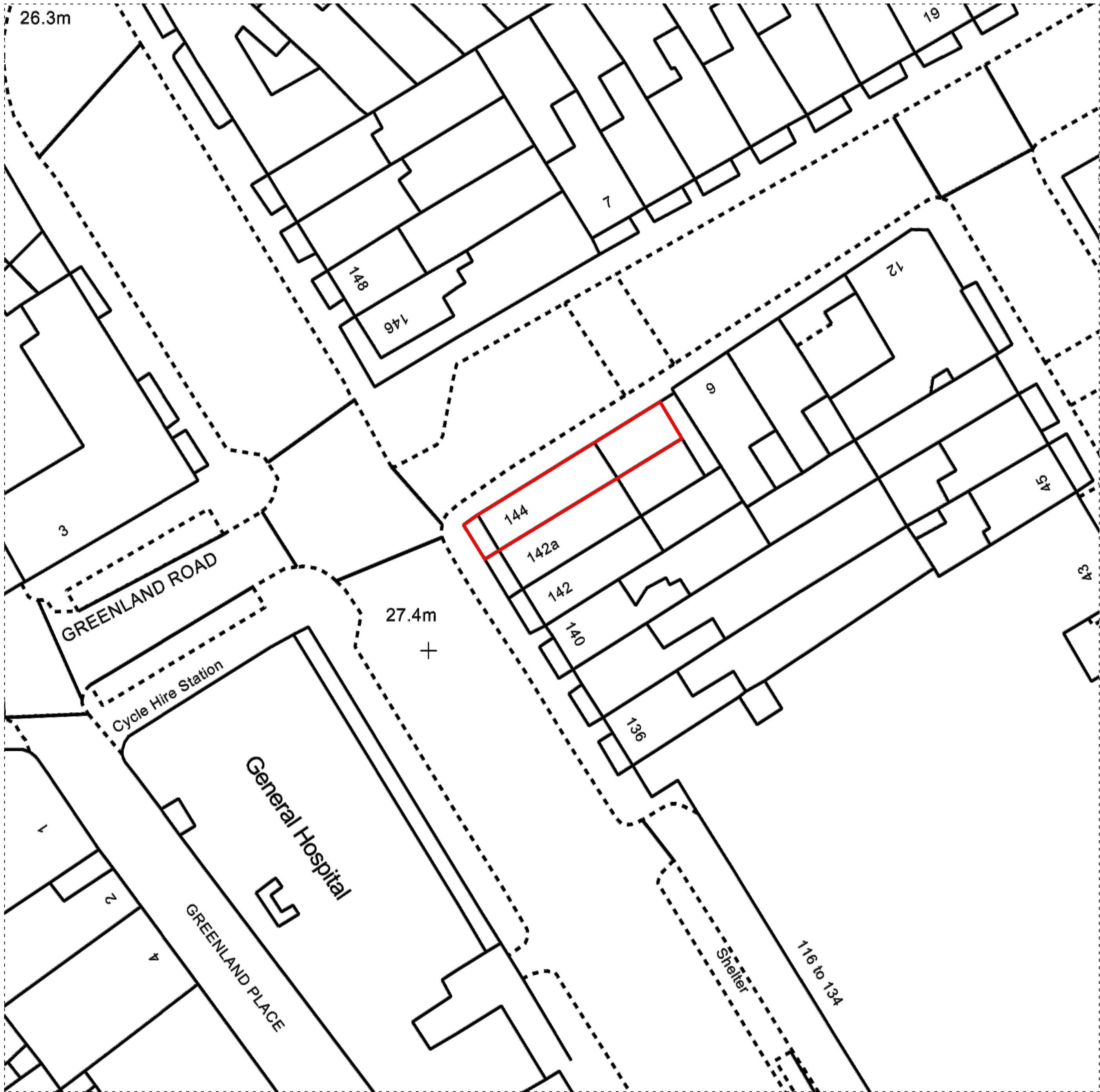
BLOCK PLAN 1:500@A3

Notes Do not scale from drawing. All dimensions to be checked on site. All levels to be checked on site. All setting out must be checked on site. This drawing is copyright WhitemanDesign. This drawing must not be used onsite unless 'Issued for Construction'.