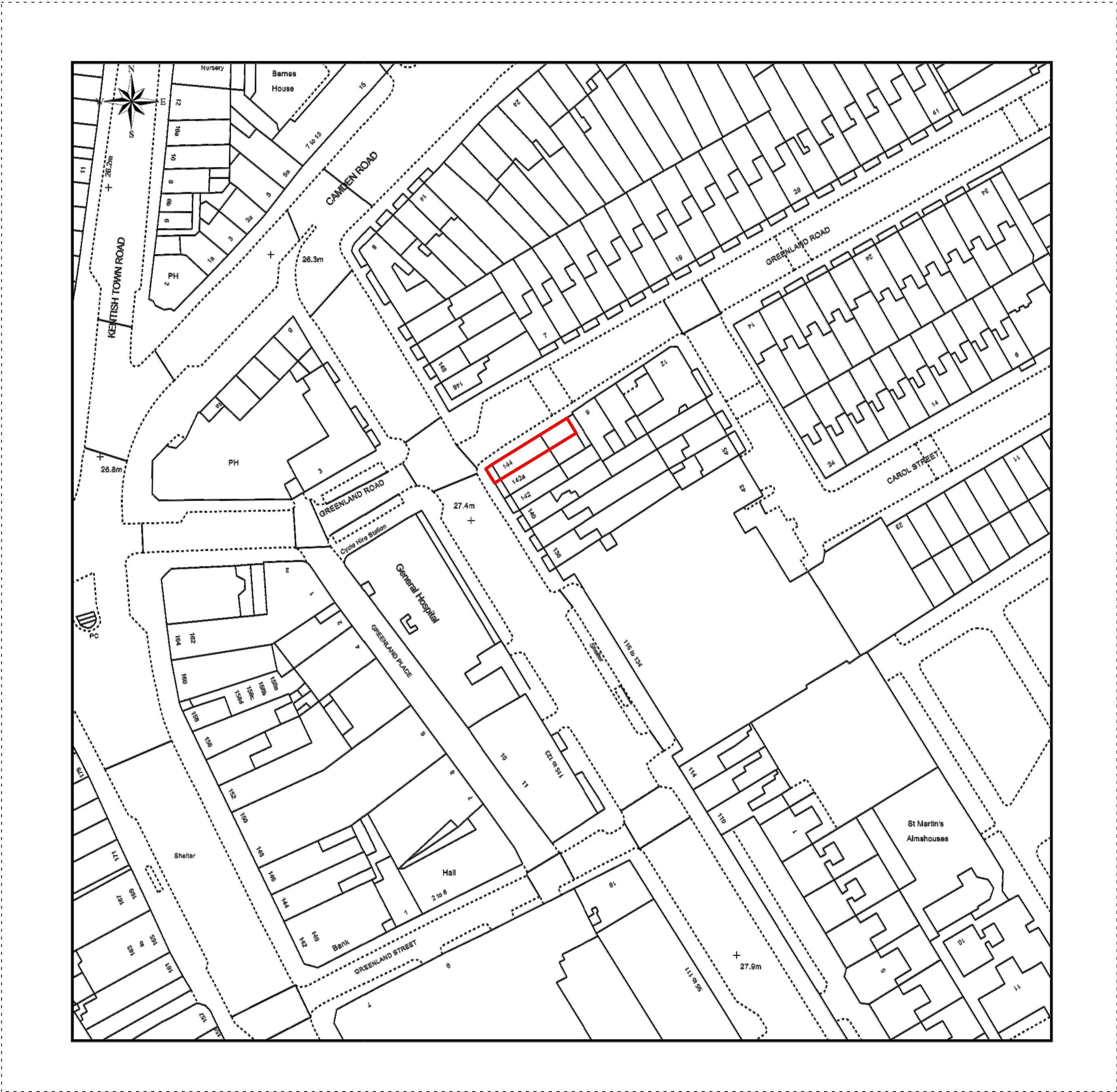
LOCATION PLAN 1:1250@A3

Notes Do not scale from drawing. All dimensions to be checked on site. All levels to be checked on site. All setting out must be checked on site. This drawing is copyright WhitemanDesign. This drawing must not be used onsite unless 'Issued for Construction'.