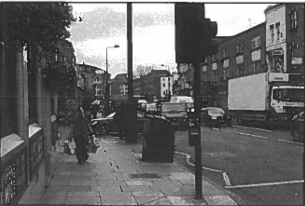
Camden High Street (no furniture)