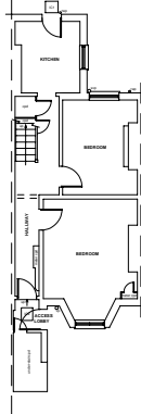
EXISTING LOWER GROUND FLOOR PLAN