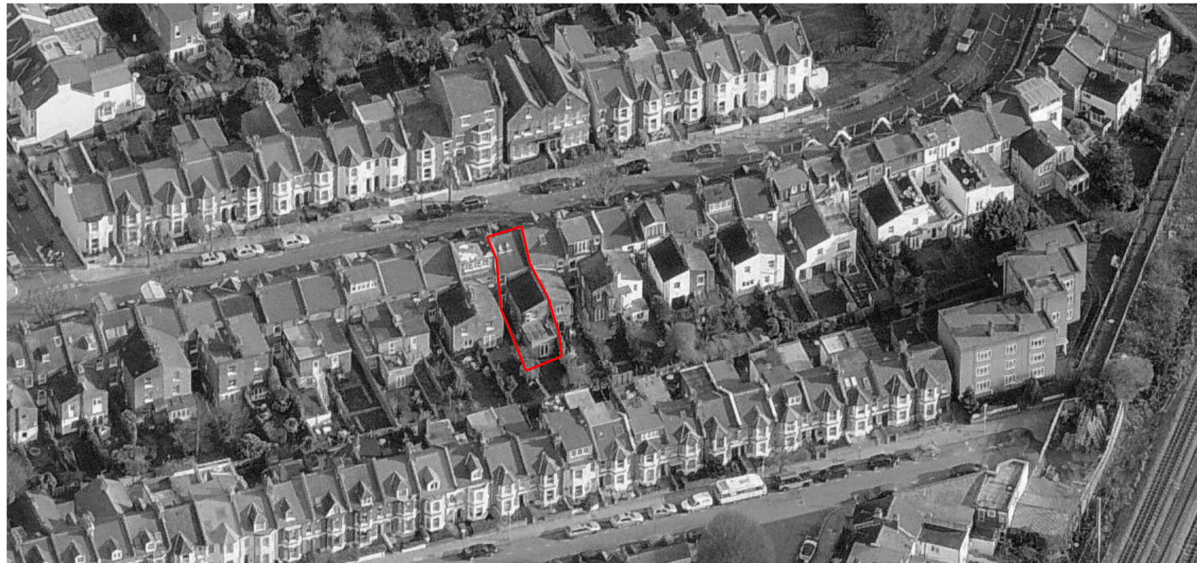
01 Front and Rear Aerial Views NTS