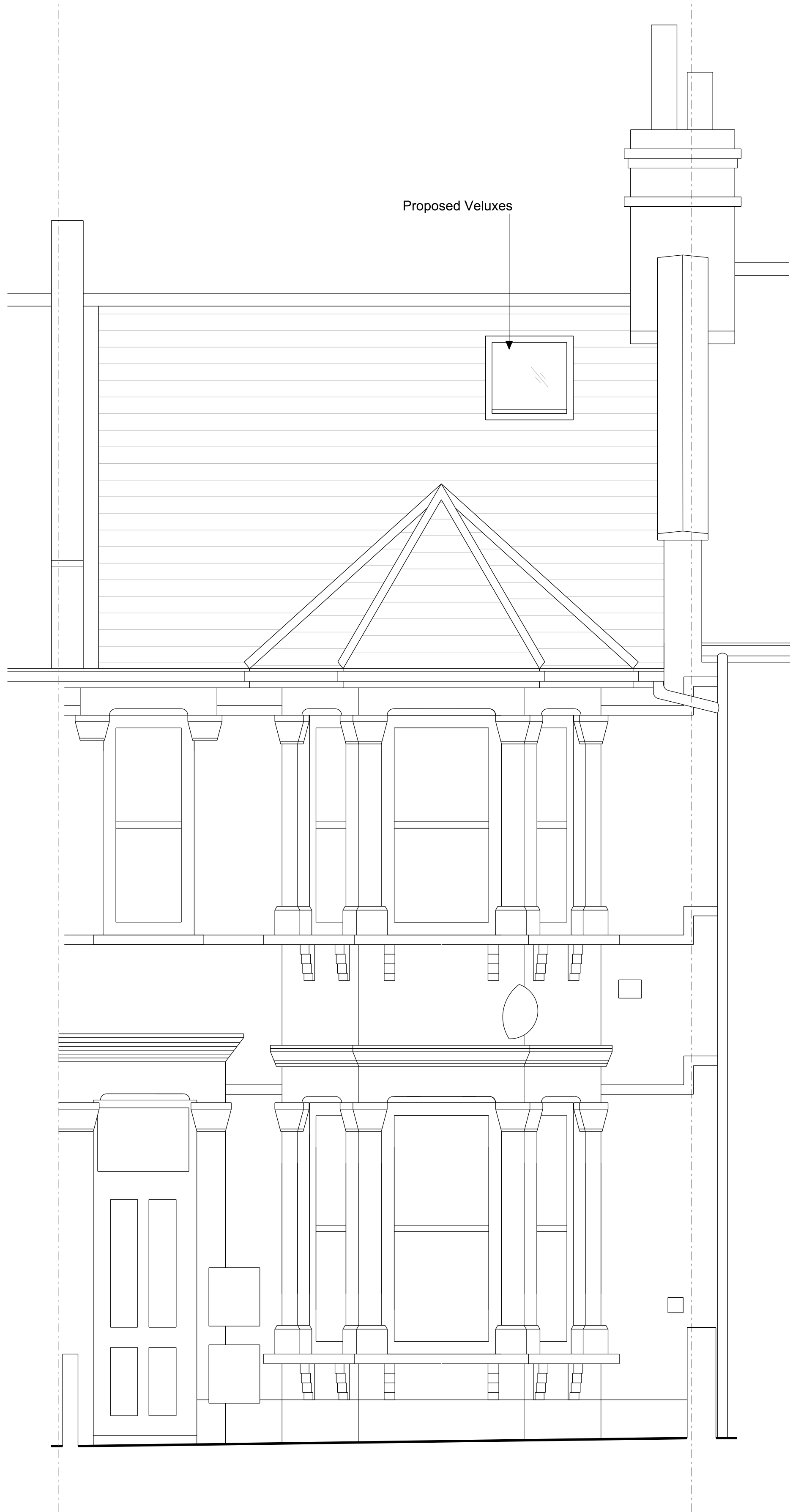
01 Front Elevation Scale 1:50 @ A3