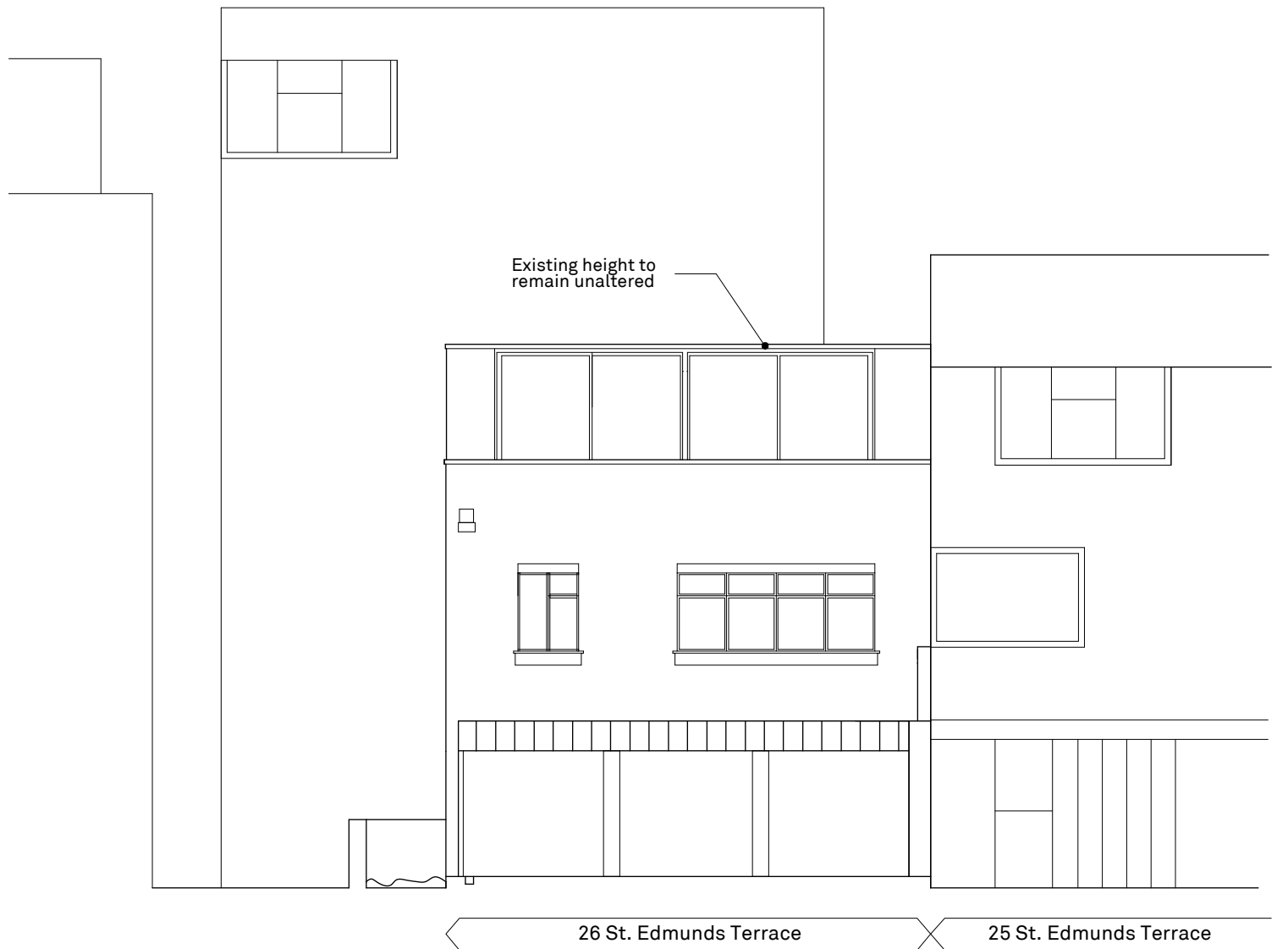
105 Existing Front Elevation 1:100