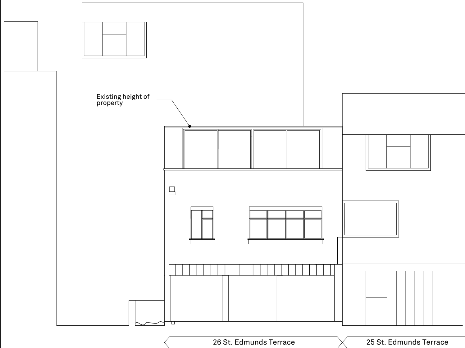
005 Existing Front Elevation 1:100