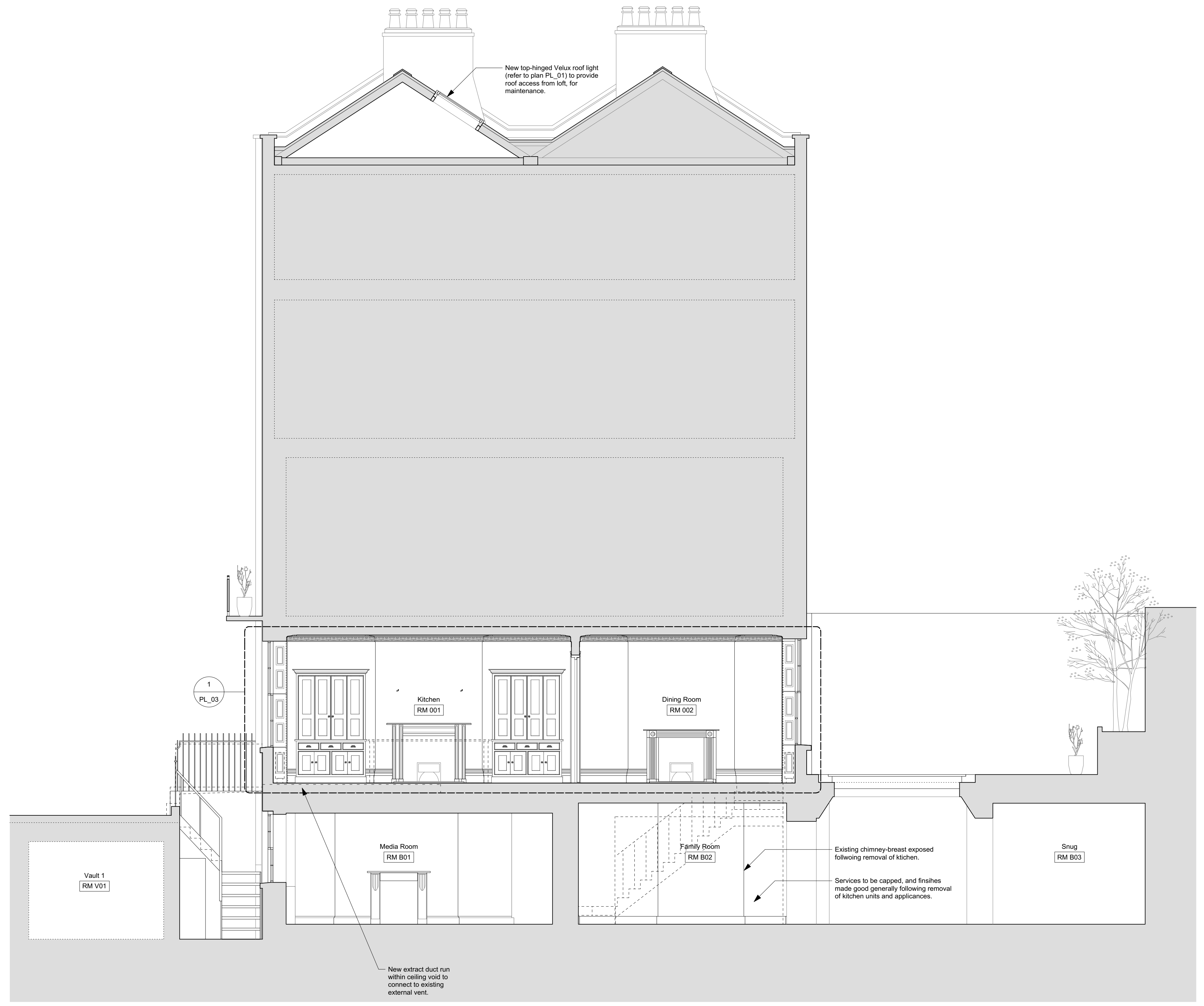
1 Proposed Section PL-02 Scale: 1:50