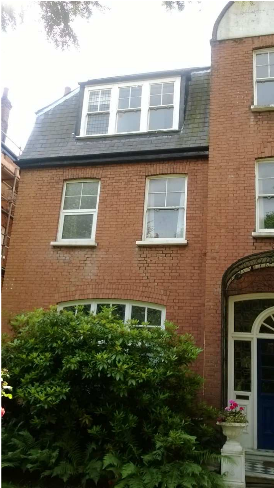
Front (North) Elevation - Rhododendron to be replanted after new light well has been built