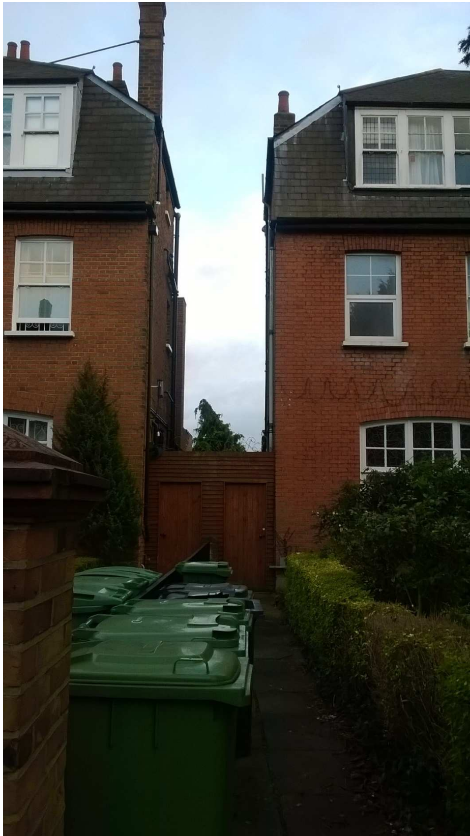
Side entrance - passage between no.26 and no.25