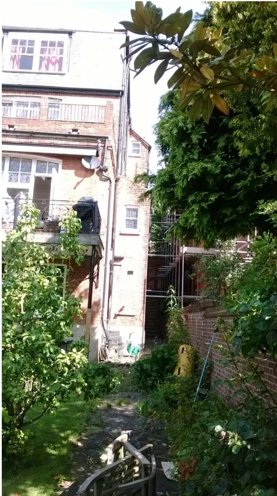
Side entrance, passage between no.26 and no.25 (South Elevation)