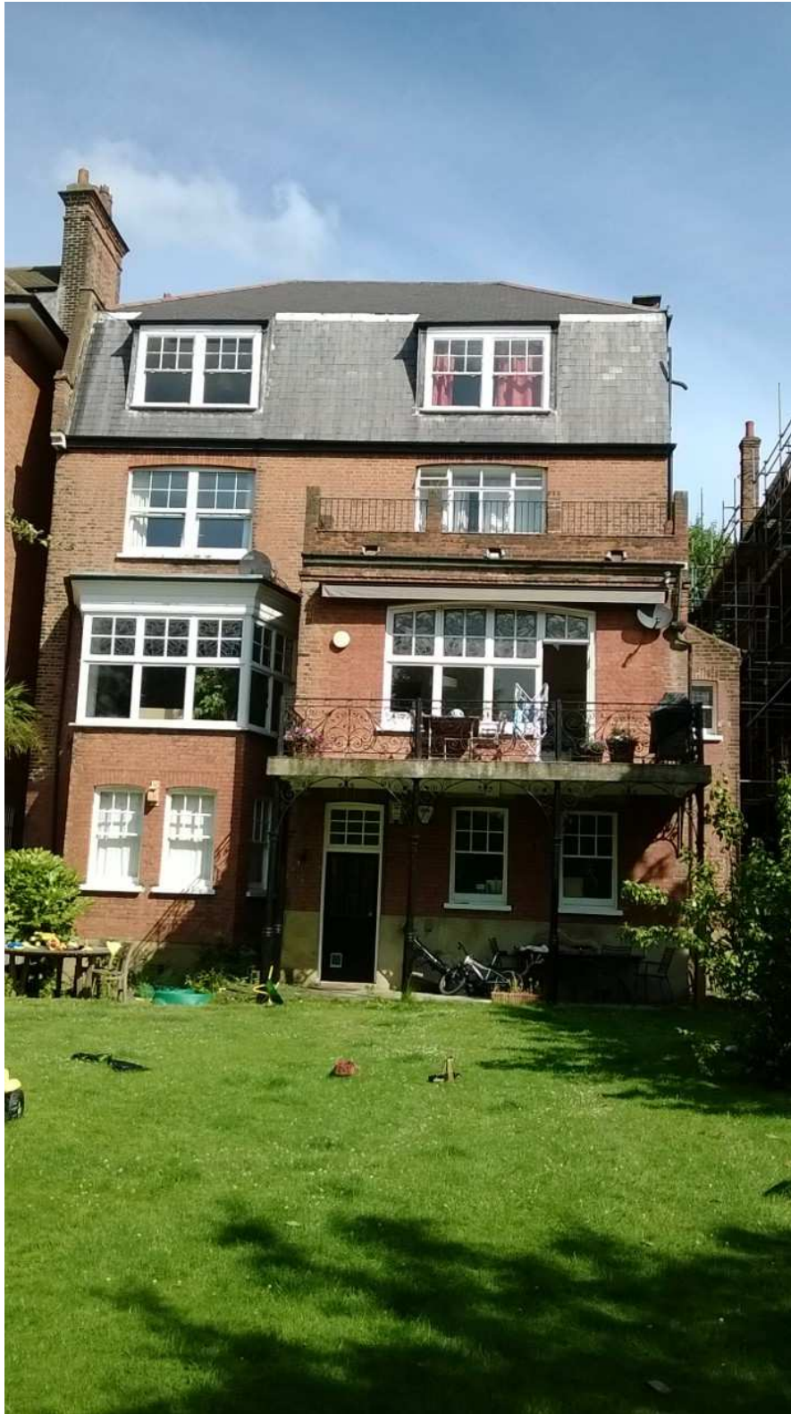
Back (South) Elevation – balustrade from the lower terrace to be re-used at the front around two light wells (existing and new)