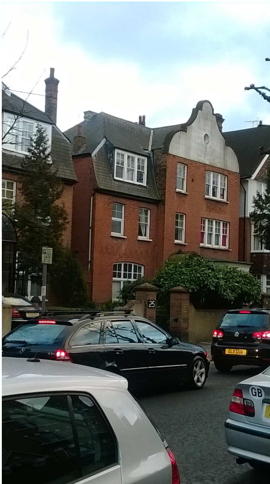
Front (North) Elevation