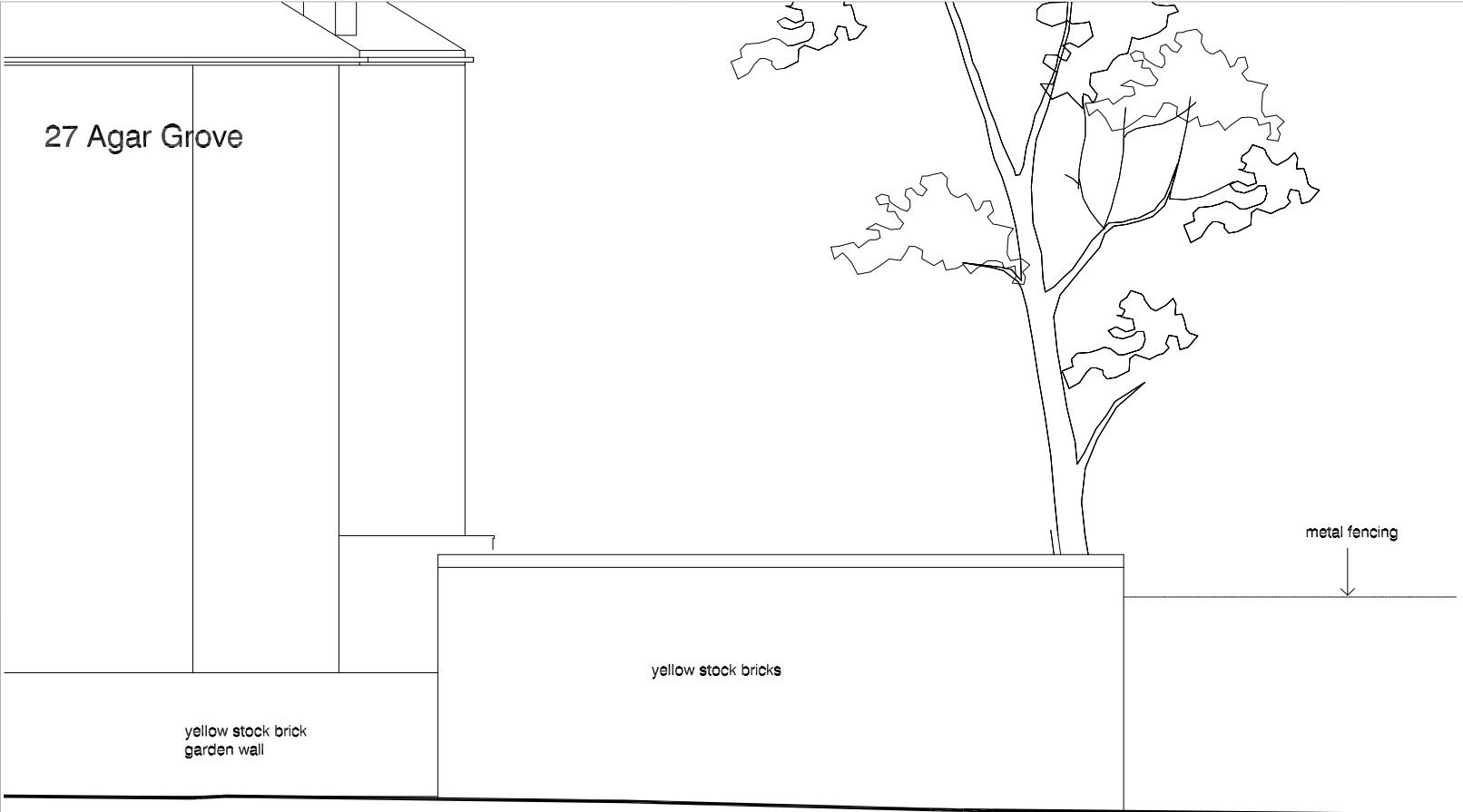
Rear (North) Elevation as existing