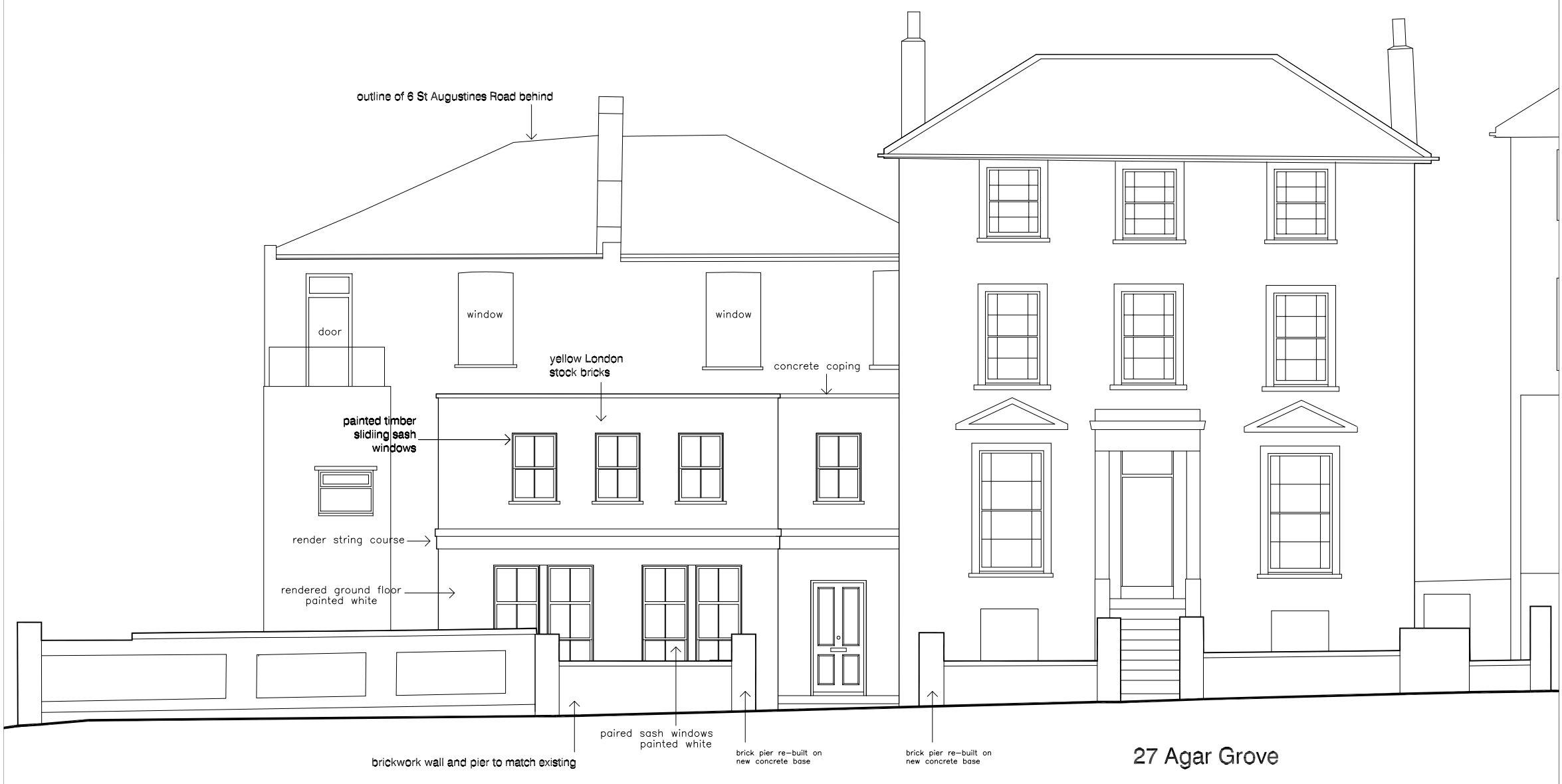
elevation to Agar Grove as proposed