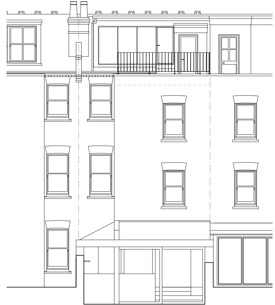
6 Proposed Front Elevation 1:100