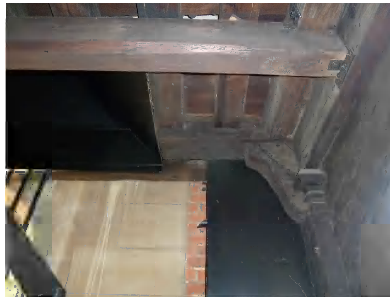
A. Photograph of Existing Timber Rafters