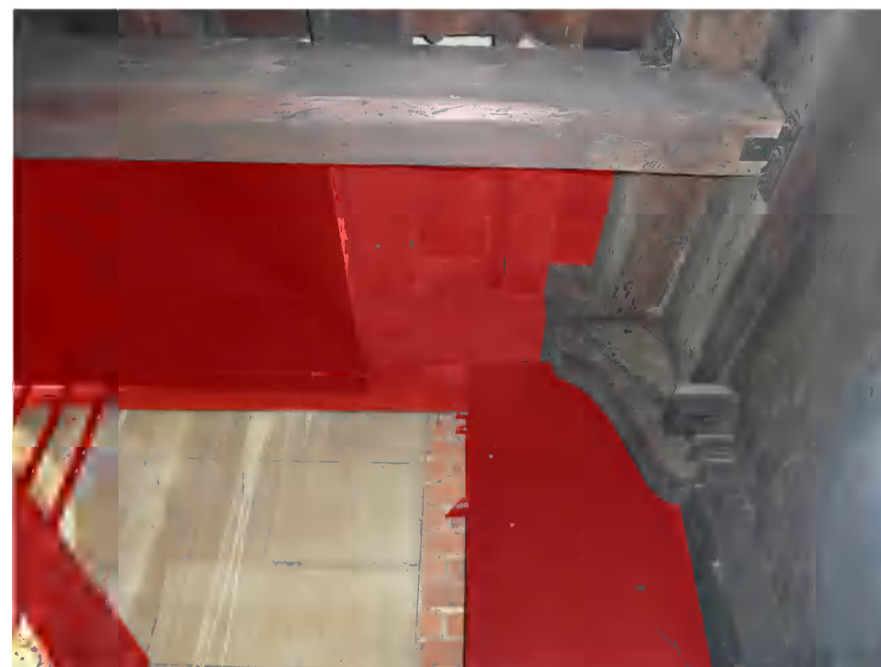
A. Photograph of Existing Timber Rafters showing proposed demolitions in red

NOTES DO NOT SCALE FROM THIS DRAWING. CONTRACTOR TO CHECK ALL DIMENSIONS ON SITE. ANY DISCREPANCIES TO BE REPORTED TO THE ARCHITECT IMMEDIATELY. COPYRIGHT RICK MATHER ARCHITECTS LLP © Text