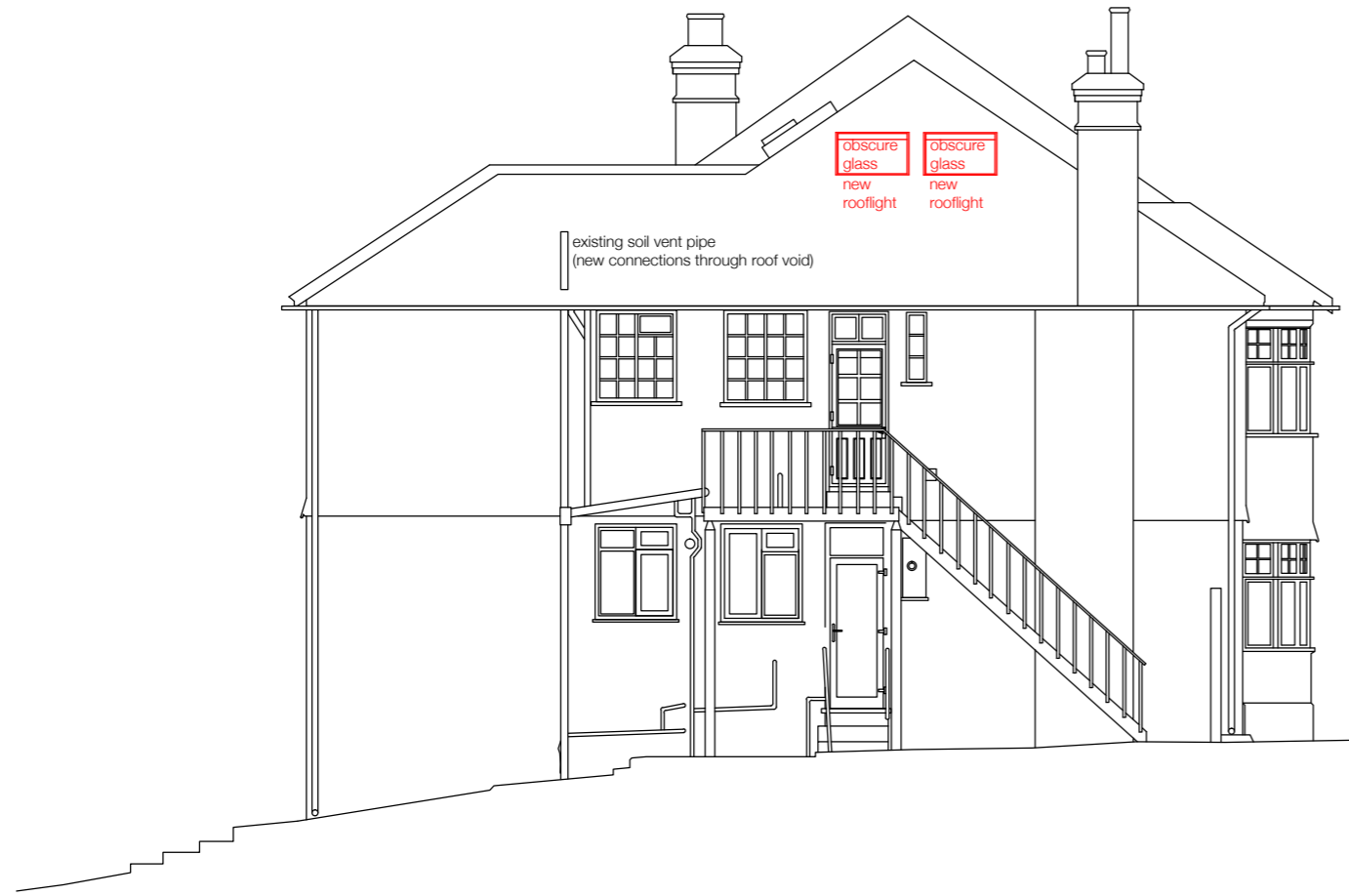
North Elevation (Side Passage) (proposal in red)