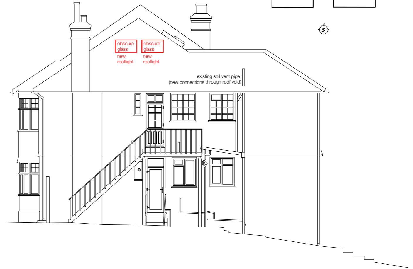
South Elevation (Side Passage) (proposal in red)