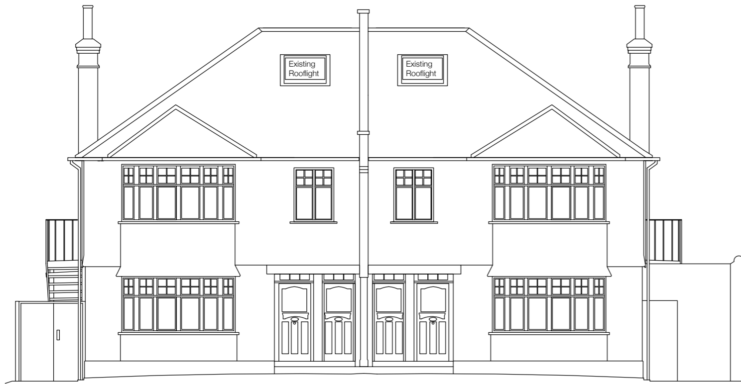
East Elevation (Street) (no change)