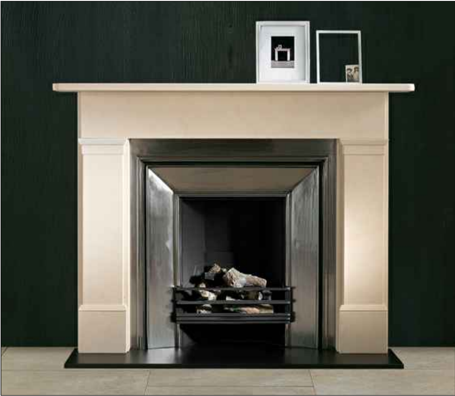
BESPOKE SIZE - THE COLEBROOKE