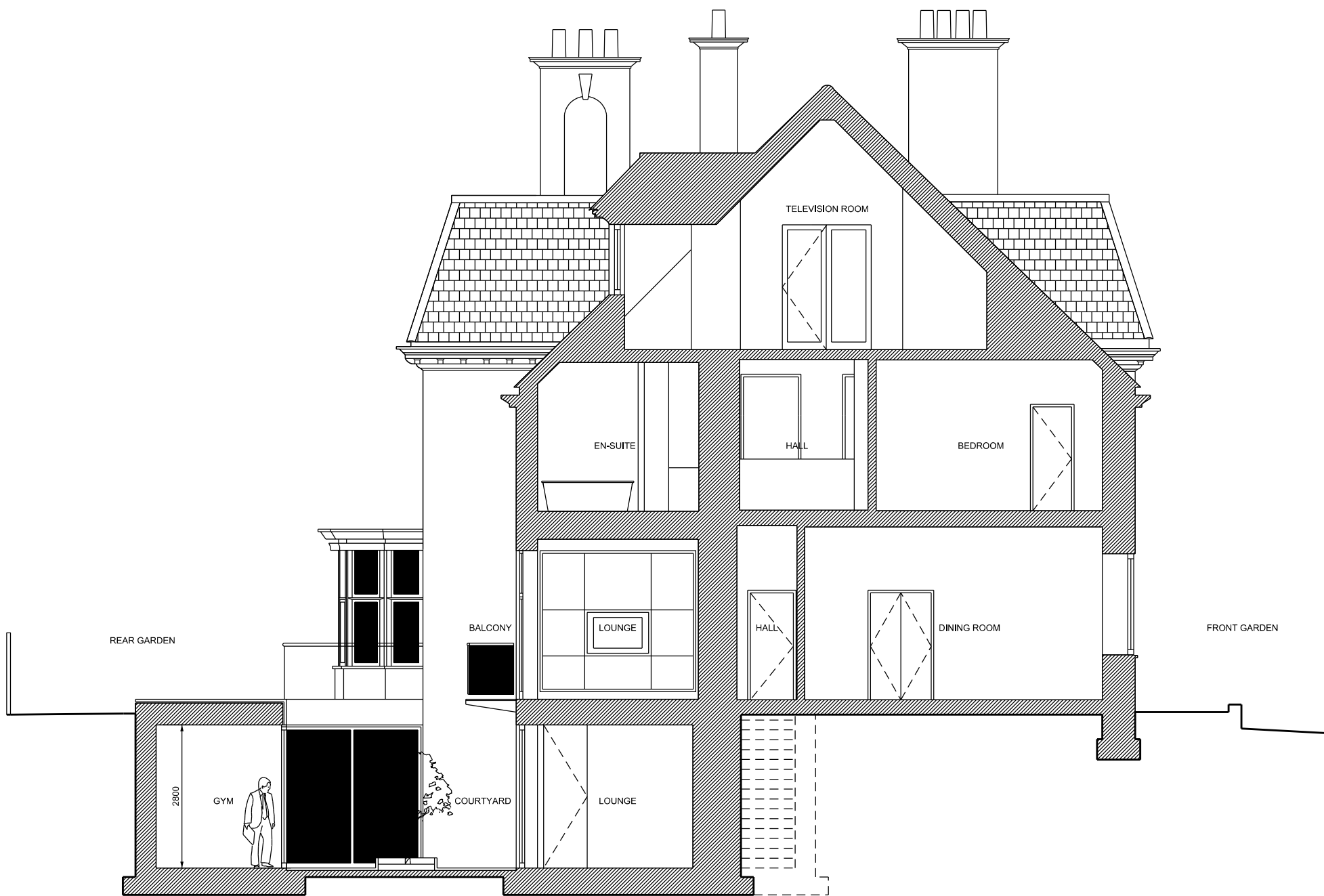
PROPOSED SECTION B