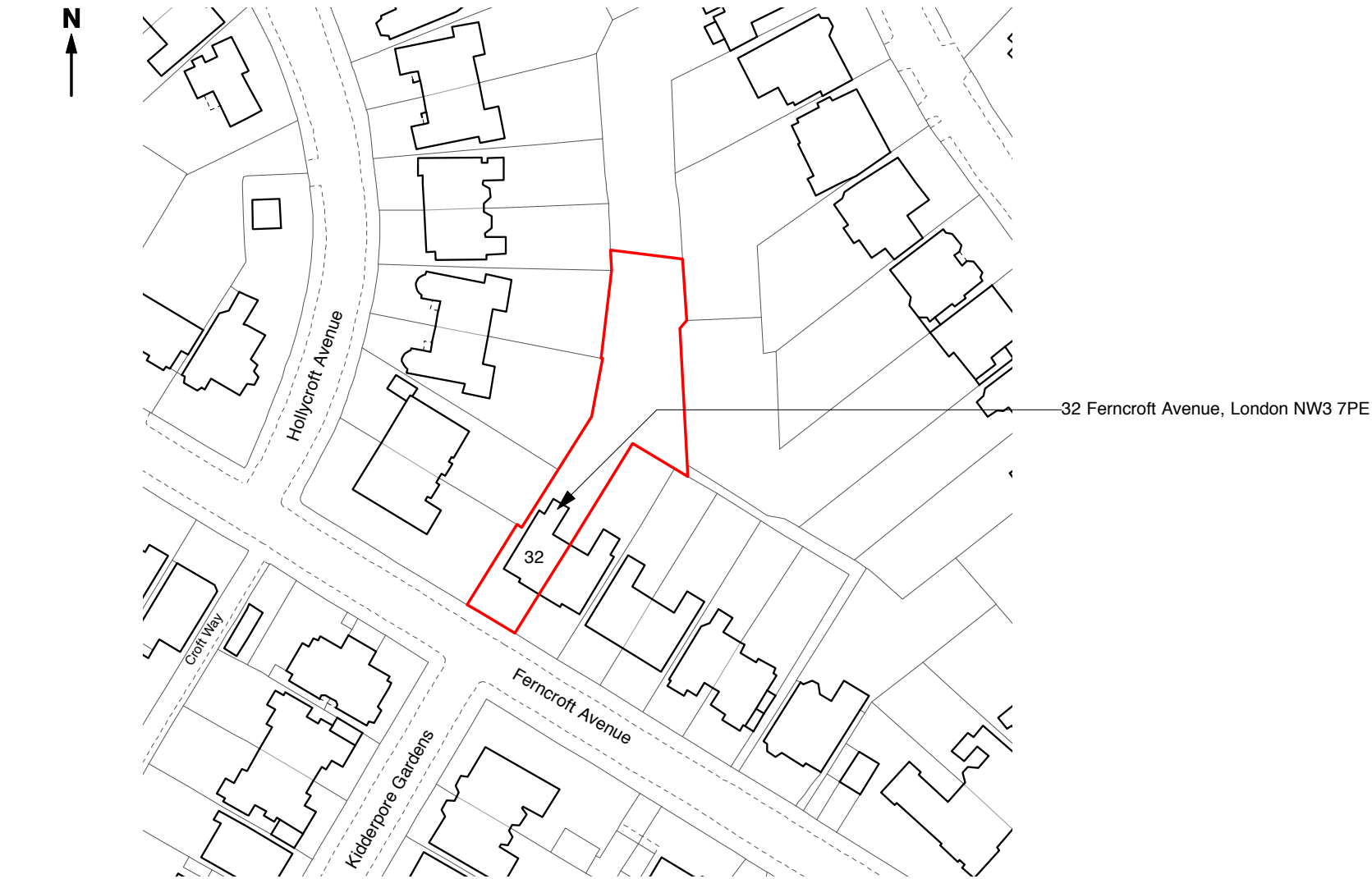
Existing Site Location Plan (1:1250)