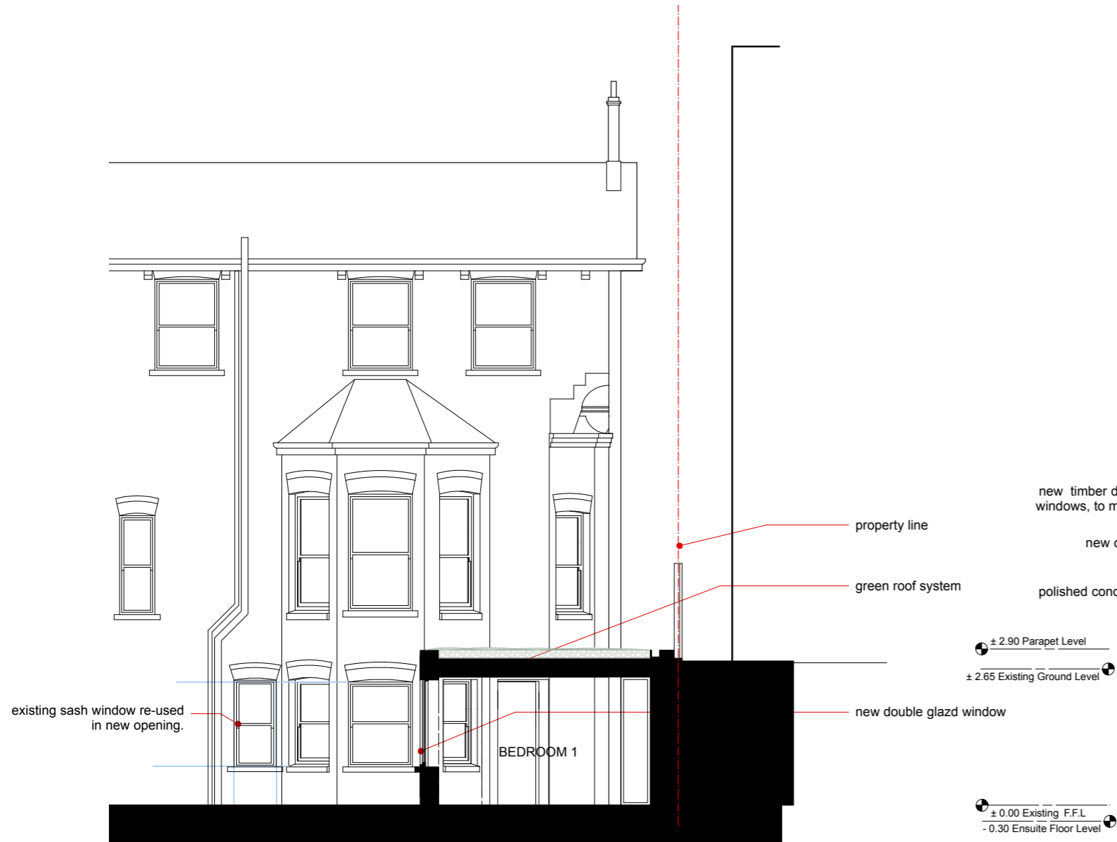
B Section B-B