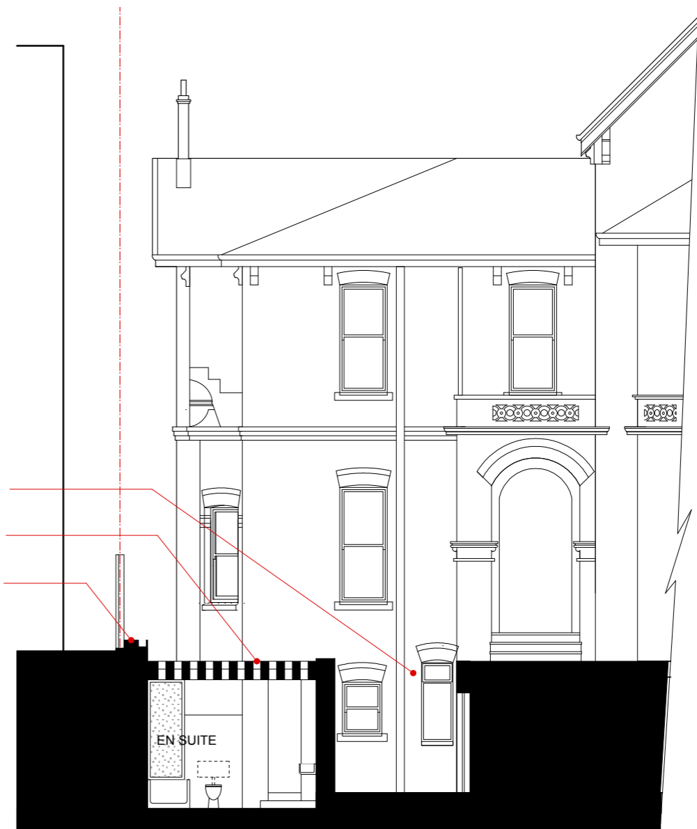
C Section C-C

existing sash window re-used in new opening.