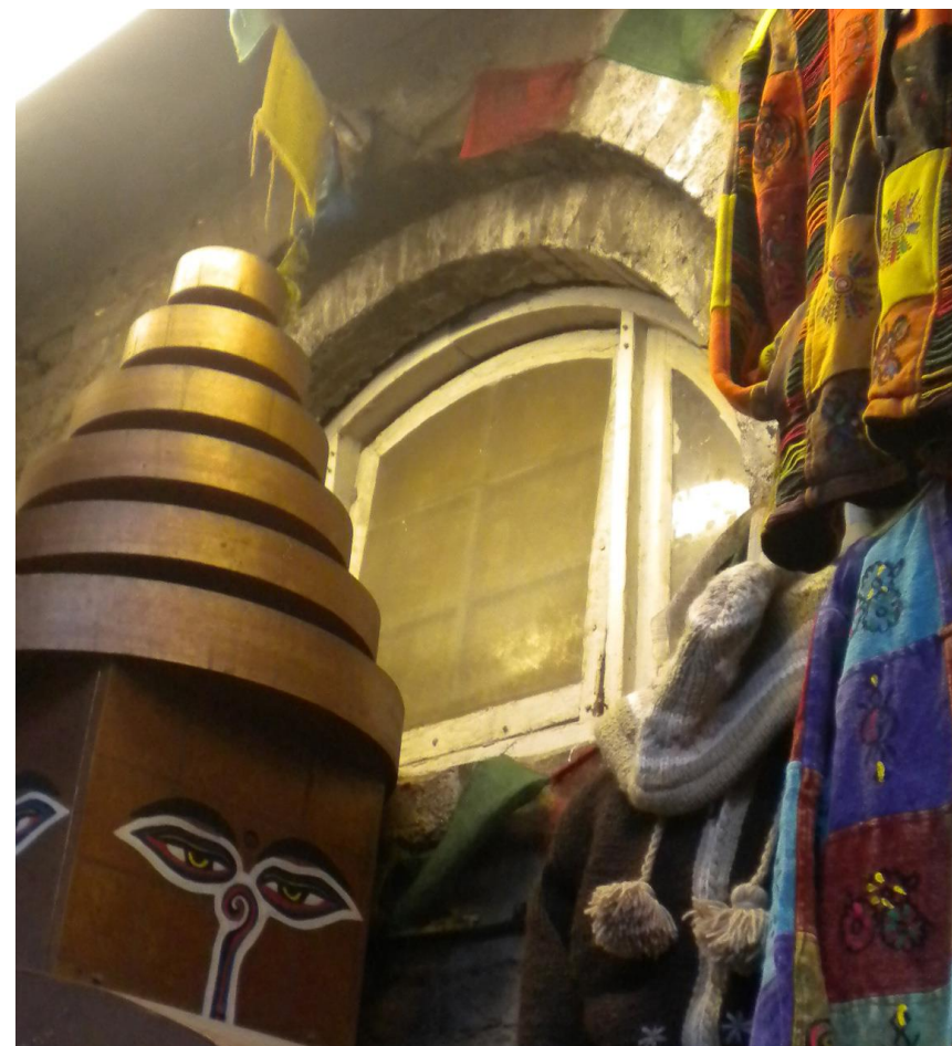
Figure 4 2014 picture of later lunette windows

The works will improve both the external appearance of the building and overall environmental and energy performance, resulting in better comfort levels for building users.