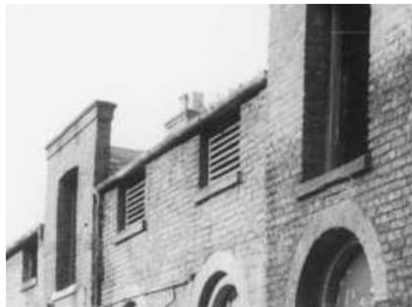
Figure 10 1975 picture of unglazed slatted openings