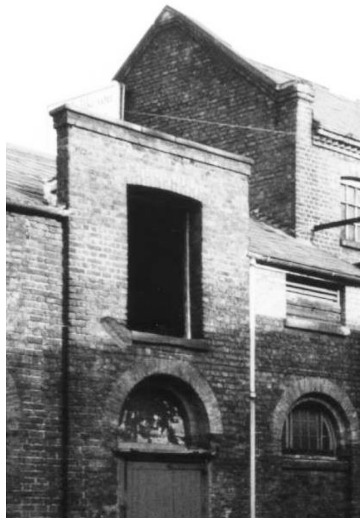
Figure 12 1975 picture of hay loft opening