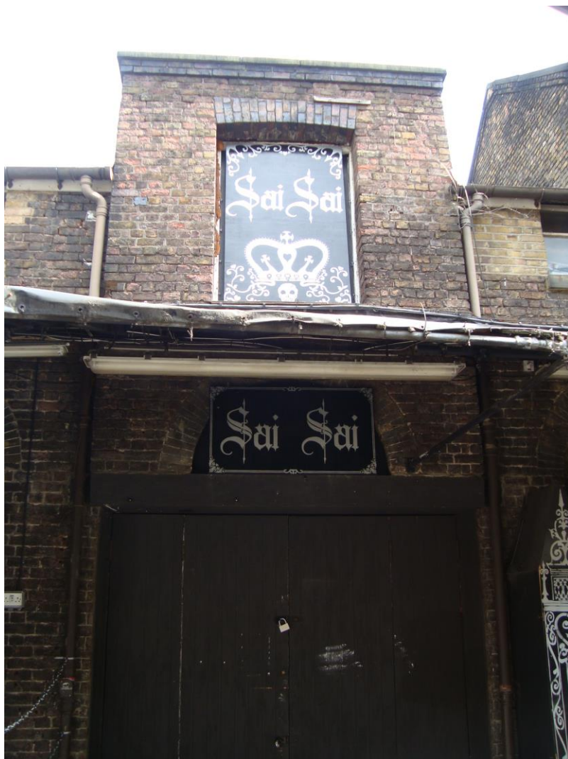
Figure 11 2014 picture of hay loft opening