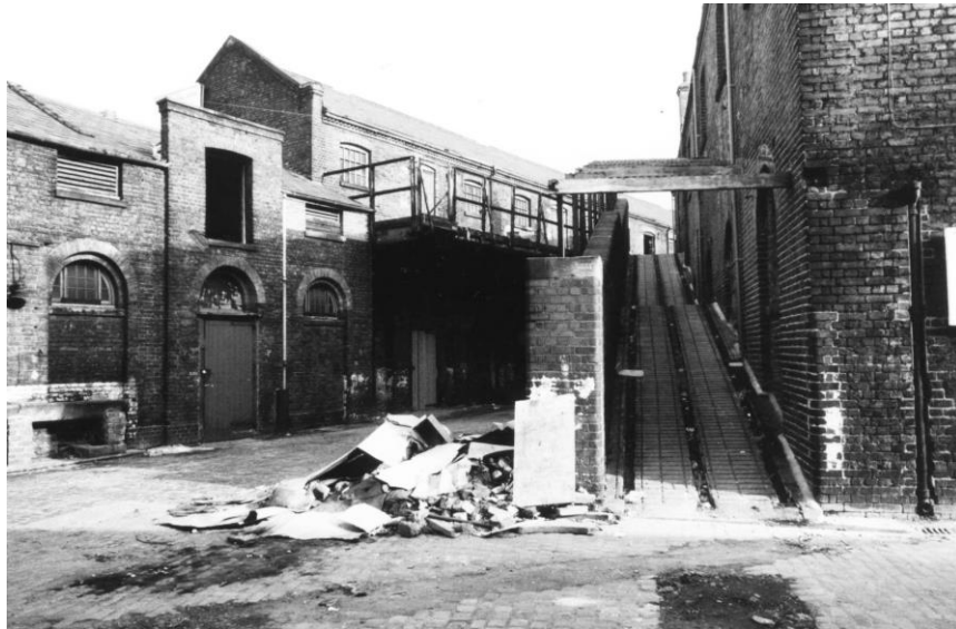
Figure 3 1975 picture of the Chalk Farm Stable.