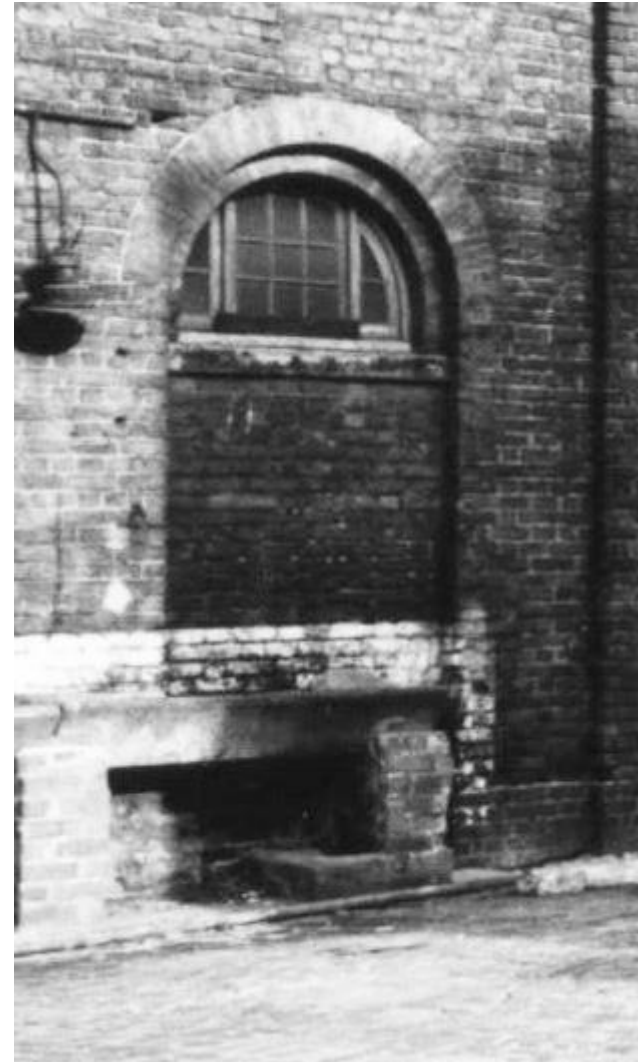
Figure 8 1975 picture of early central pivot lunette window