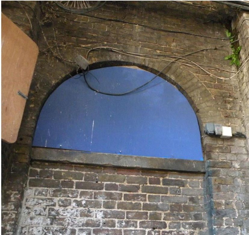
Figure 5 2014 picture of missing central pivot lunette windows