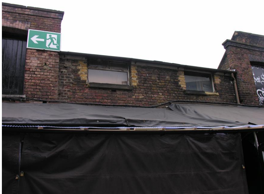
Figure 9 2014 picture of later windows to previously existing slatted openings