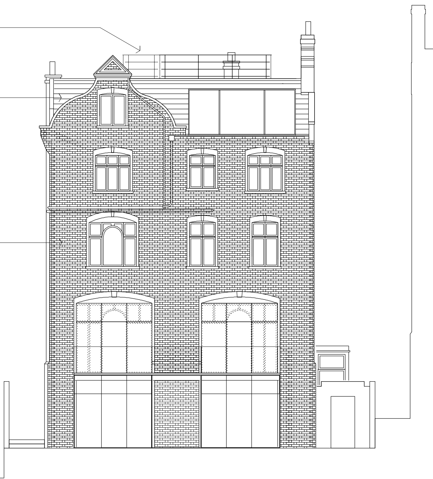
REAR ELEVATION (EAST)