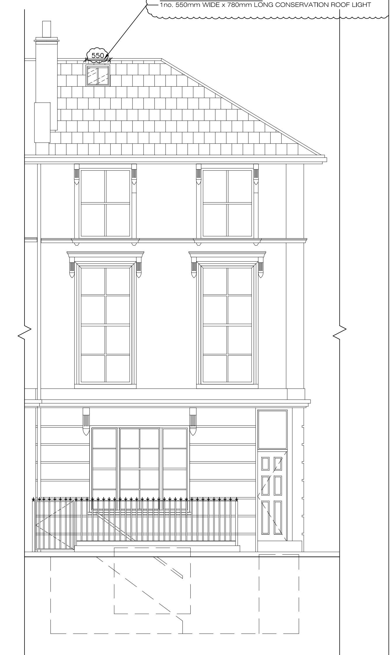
3 FRONT (EDIS STREET) ELEVATION : PROPOSED Scale 1:50