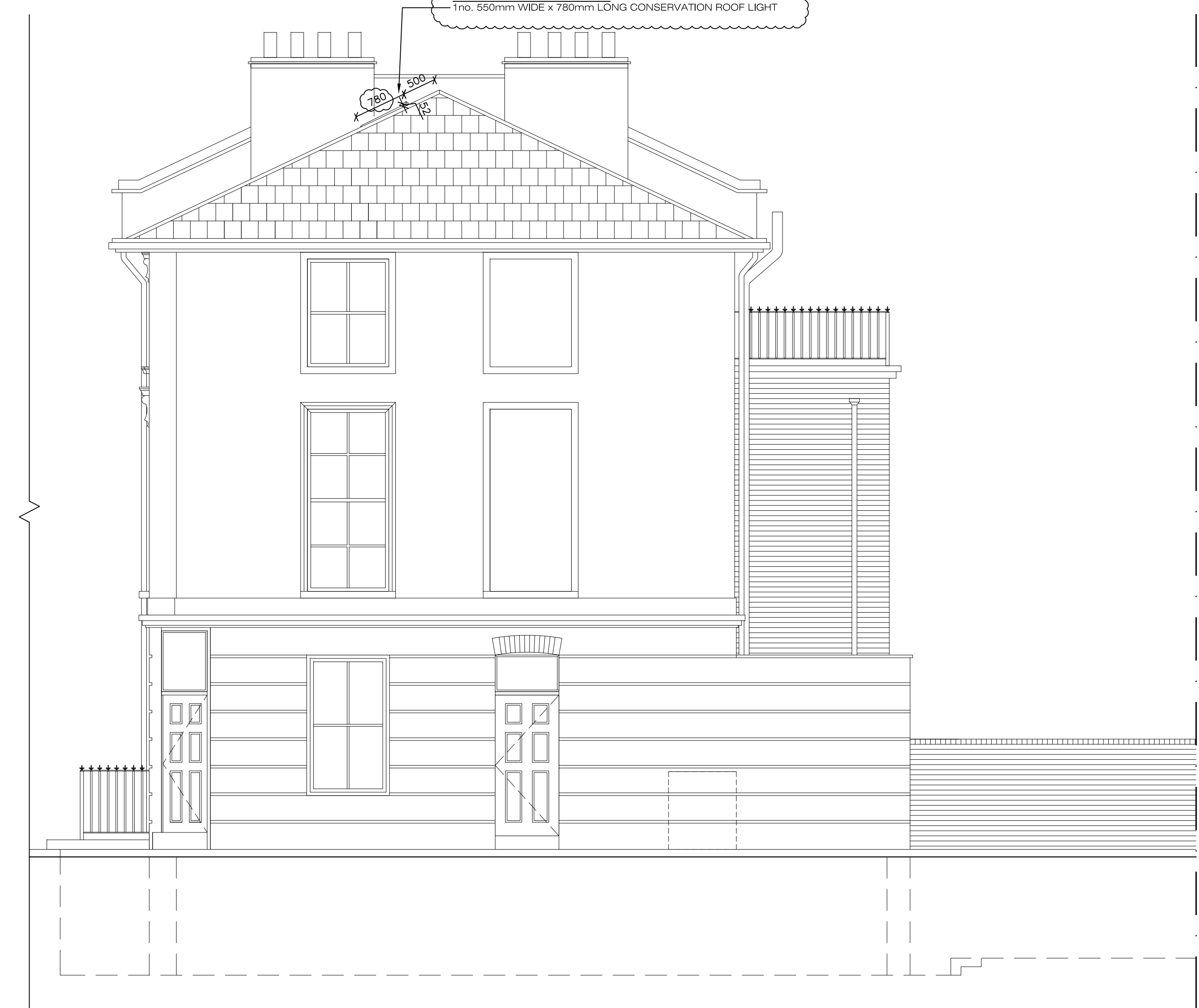
2 SIDE (CHALCOT ROAD) ELEVATION : PROPOSED Scale 1:50