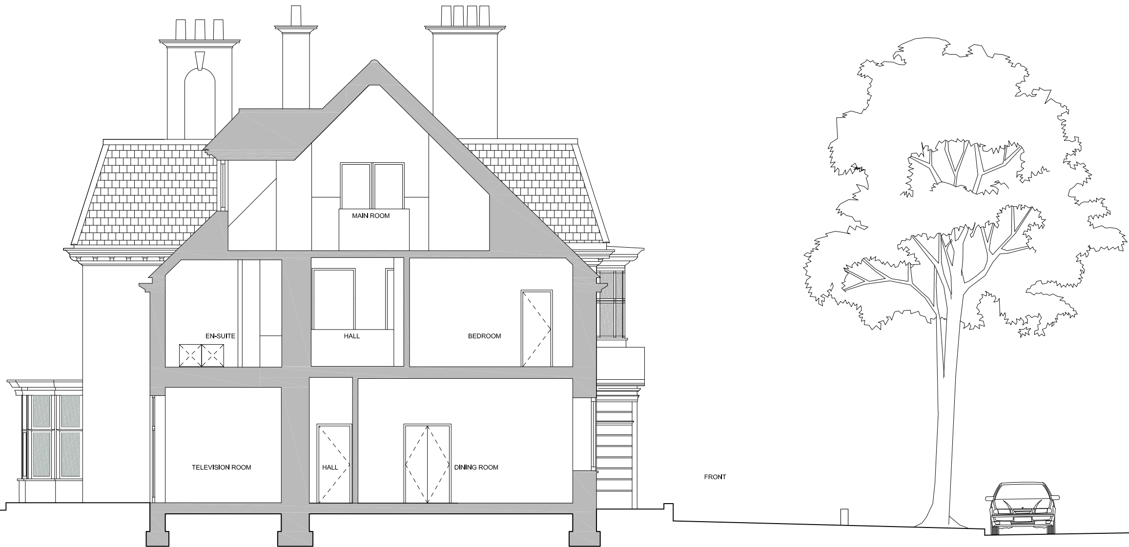
Existing Section B Scale 1:50 @A1

NOTES: 1. Do not scale drawings 2. All dimensional discrepancies to be reported to architect 3. The contractor must check all dimensions on site before construction / fabrication THIS DRAWING HAS BEEN PREPARED BY DS DESIGN SOLUTIONS AND THE DATA CONTAINED HEREIN MAY BE USED OR REPRODUCED ONLY WITH DS DESIGN SOLUTIONS' APPROVAL.