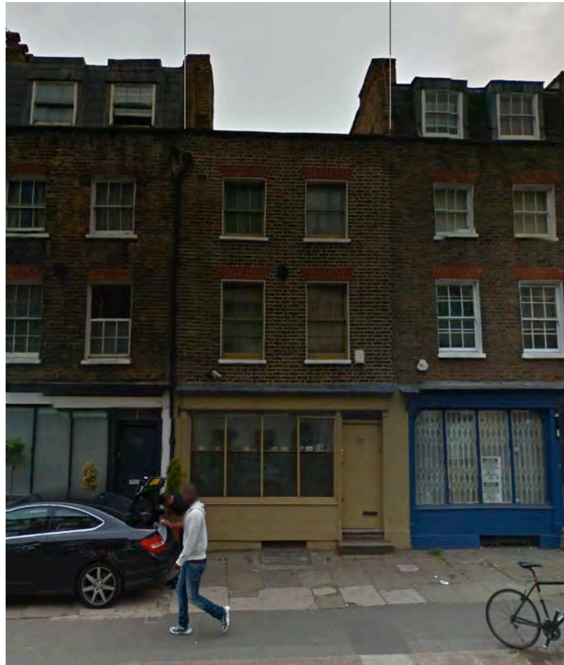
Existing front external elevation