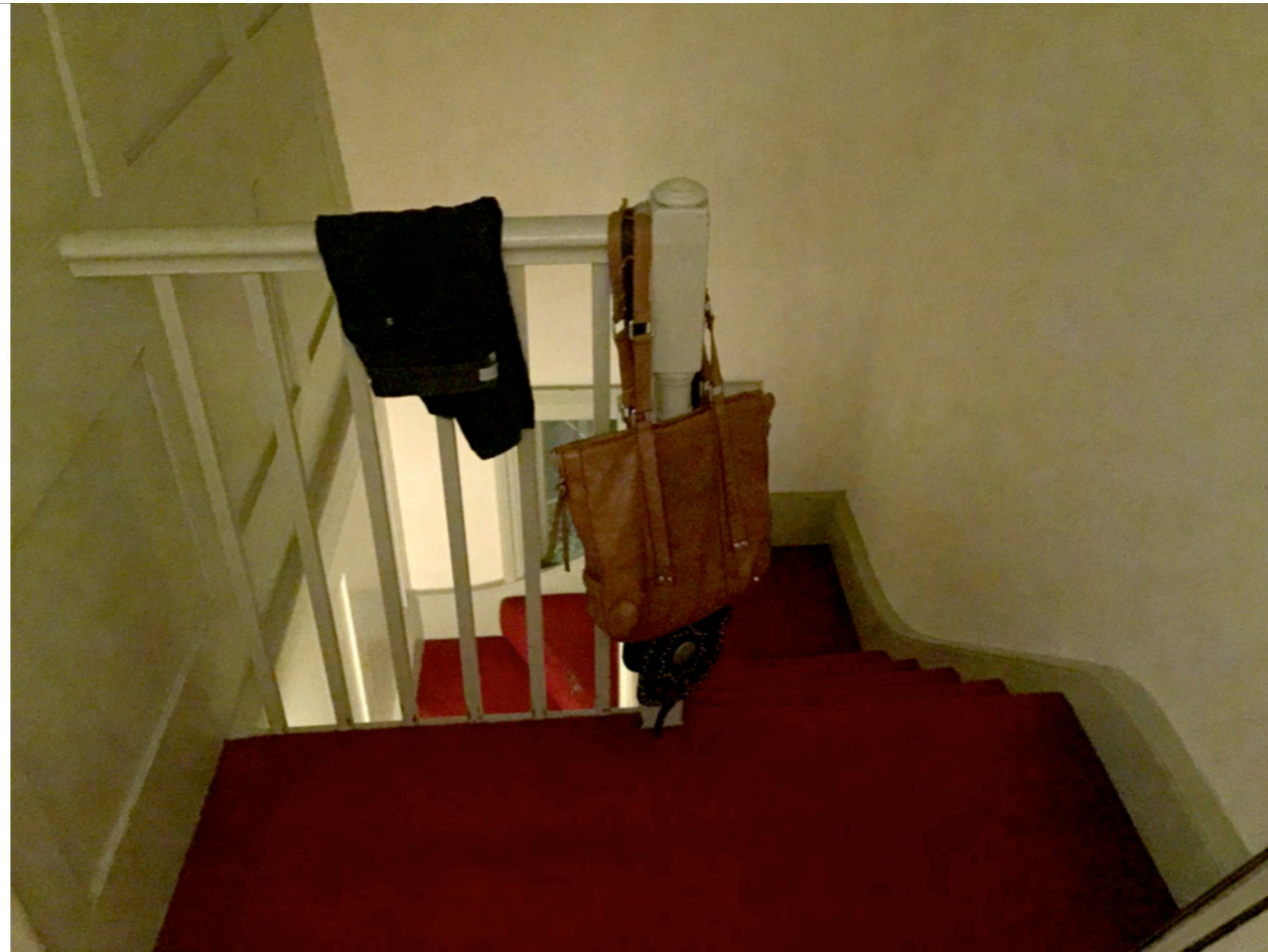
Existing staircase. View from existing top (2F) floor landing area looking towards rear of house. No proposed changes