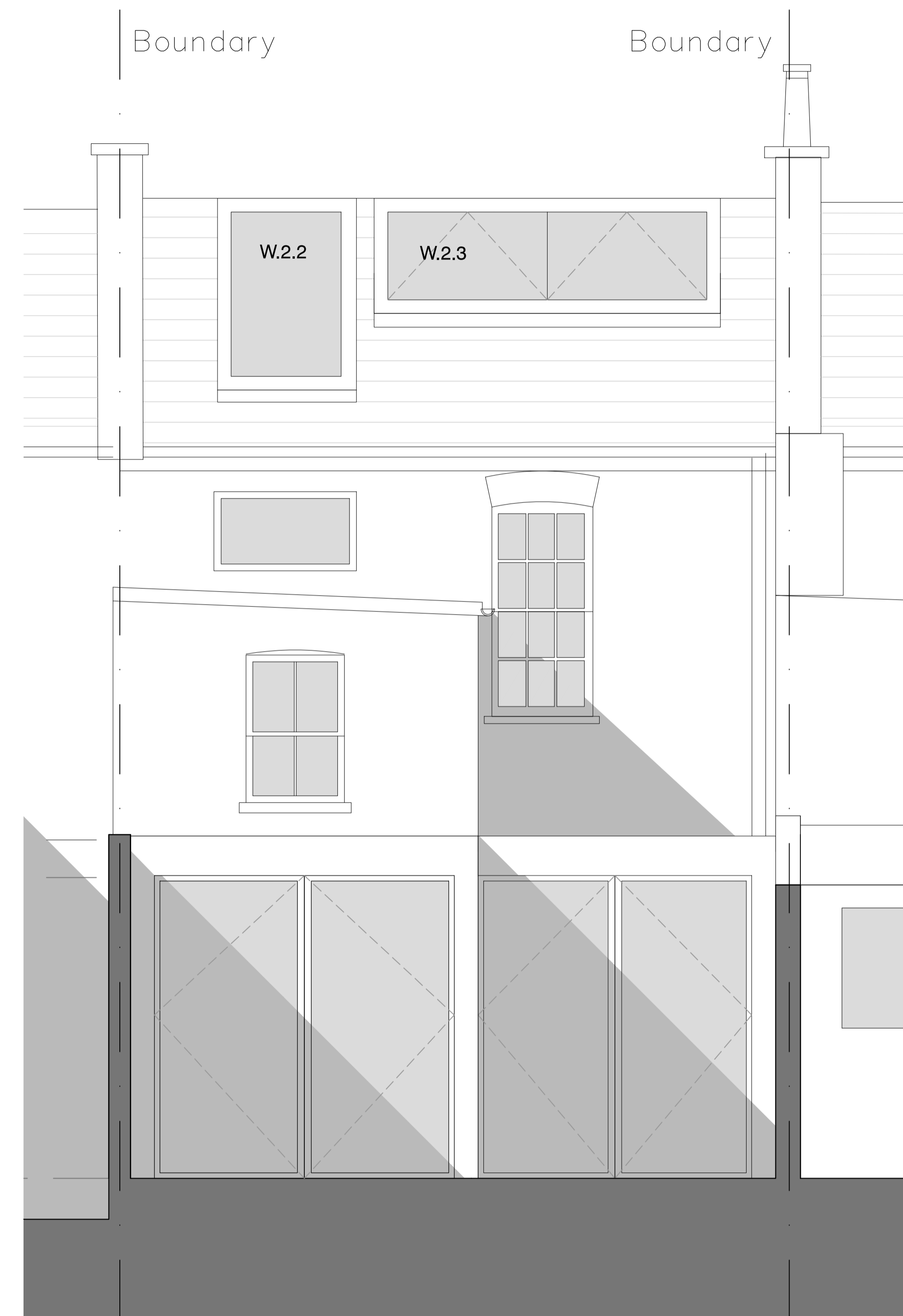
82 Harmood Street