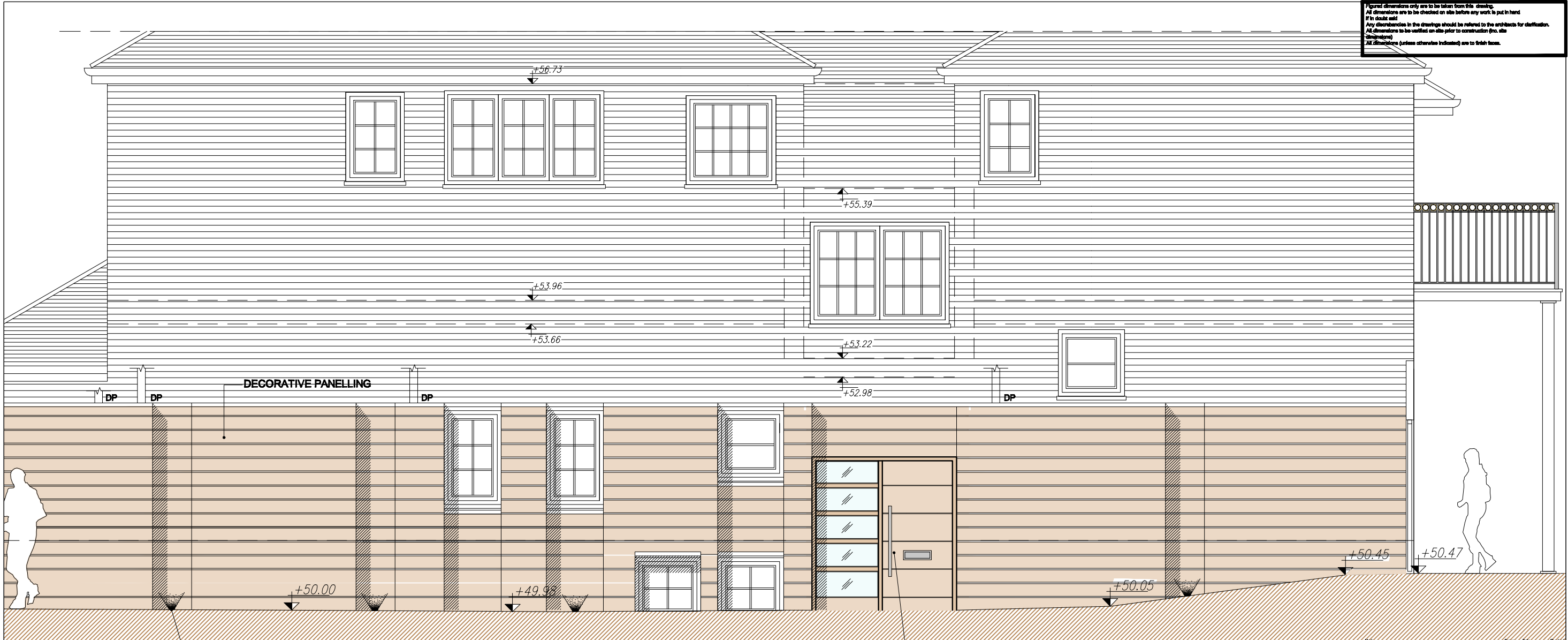
PASSAGEWAY TO APT. ENTRANCE SIDE ELEVATION AS PROPOSED SCALE 1:50

Figured dimensions only are to be taken from this drawing. All dimensions are to be checked on site before any work is put in hand if in doubt call Any discrepancies in the drawings should be referred to the architect for clarification. All dimensions to be verified on site prior to construction (i.e. site dimensions) All dimensions (unless otherwise indicated) are to finish face.