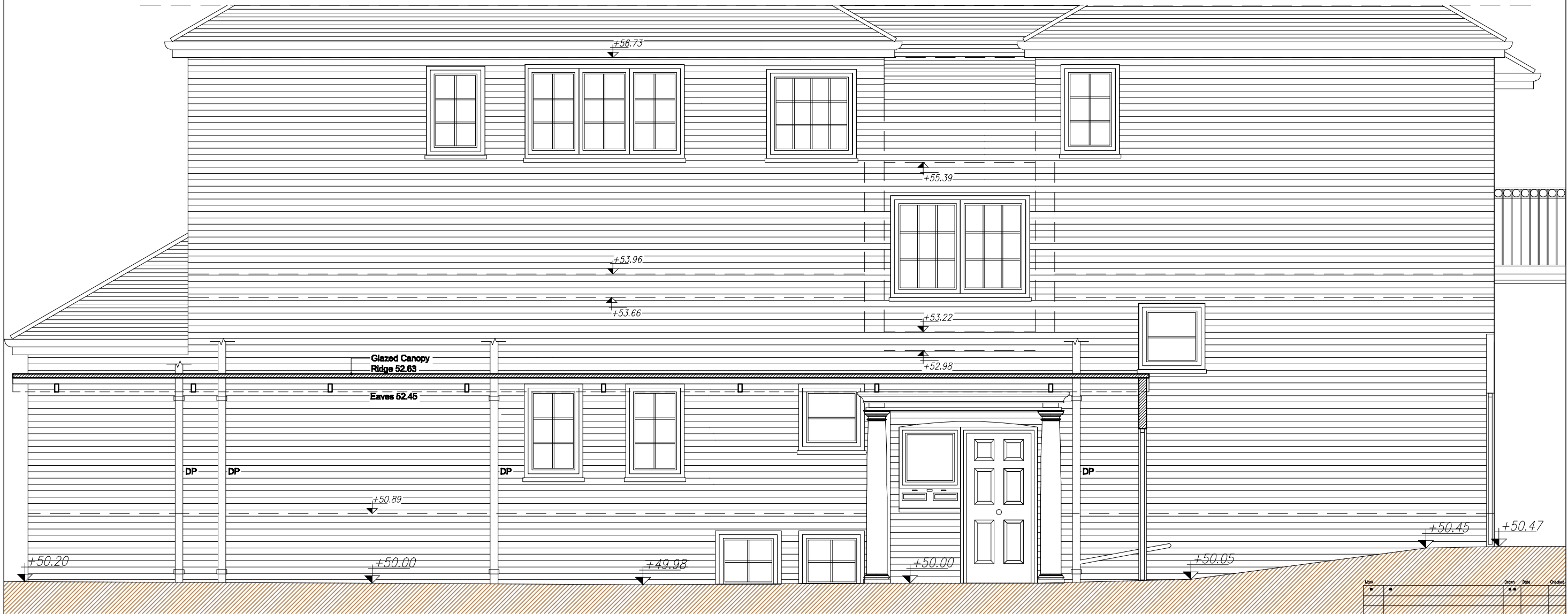
PASSAGEWAY TO APT. ENTRANCE SIDE ELEVATION AS EXISTING SCALE 1:50

Figured dimensions only are to be taken from this drawing. All dimensions are to be checked on site before any work is put in hand if in doubt call! Any discrepancies in the drawings should be referred to the architect for clarification. All dimensions to be verified on site prior to construction (i.e. site dimensions) All dimensions (unless otherwise indicated) are to finish face.