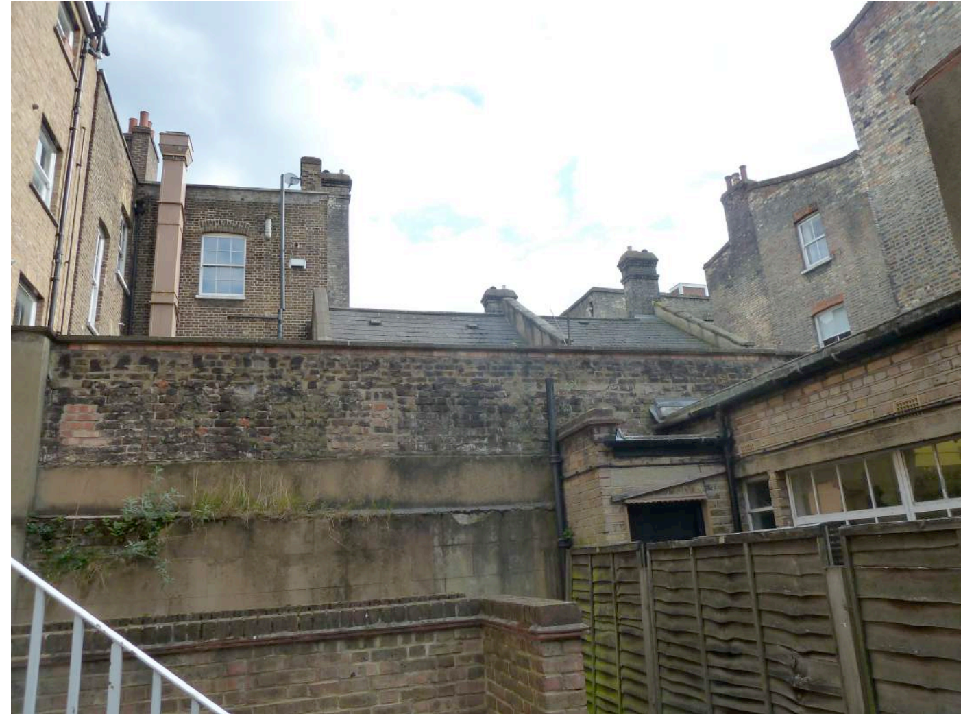
2 PHOTOGRAPH OF SOUTH ELEVATION