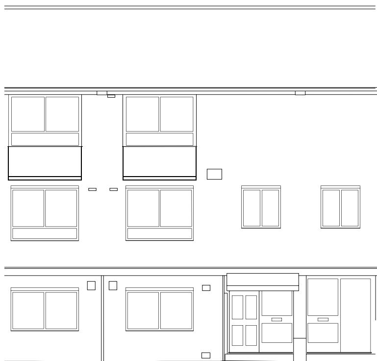
Datum: 35.00m. Front Elevation