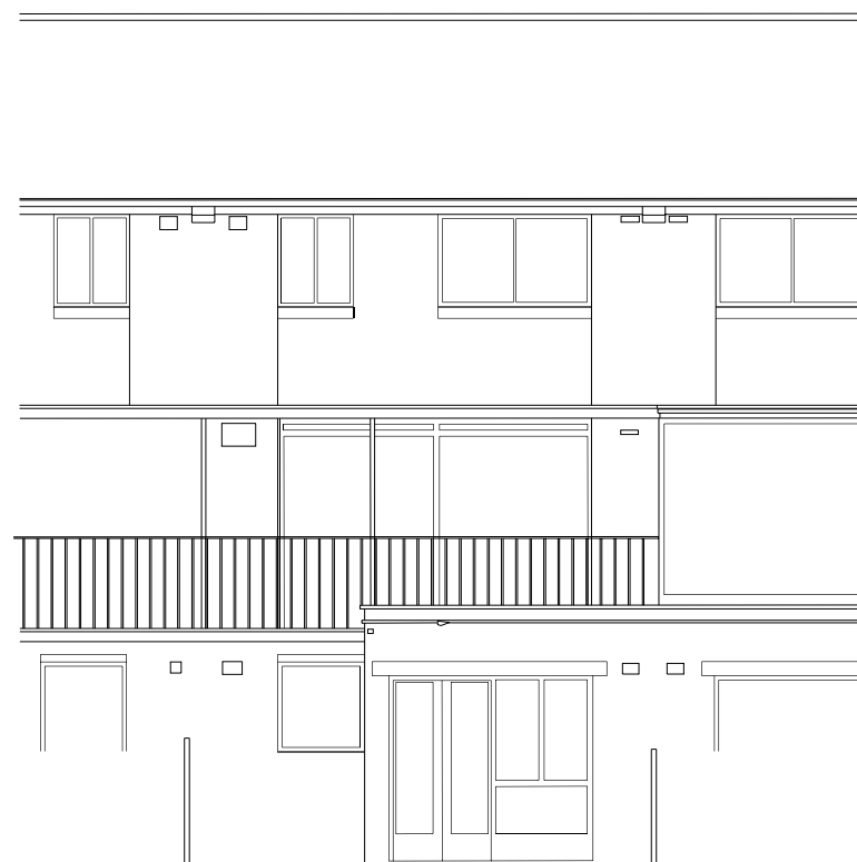
Datum: 35.00m. Back Elevation