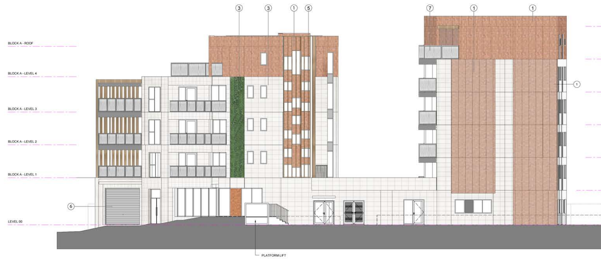
2 EAST ELEVATION-PLANNING 1 : 100