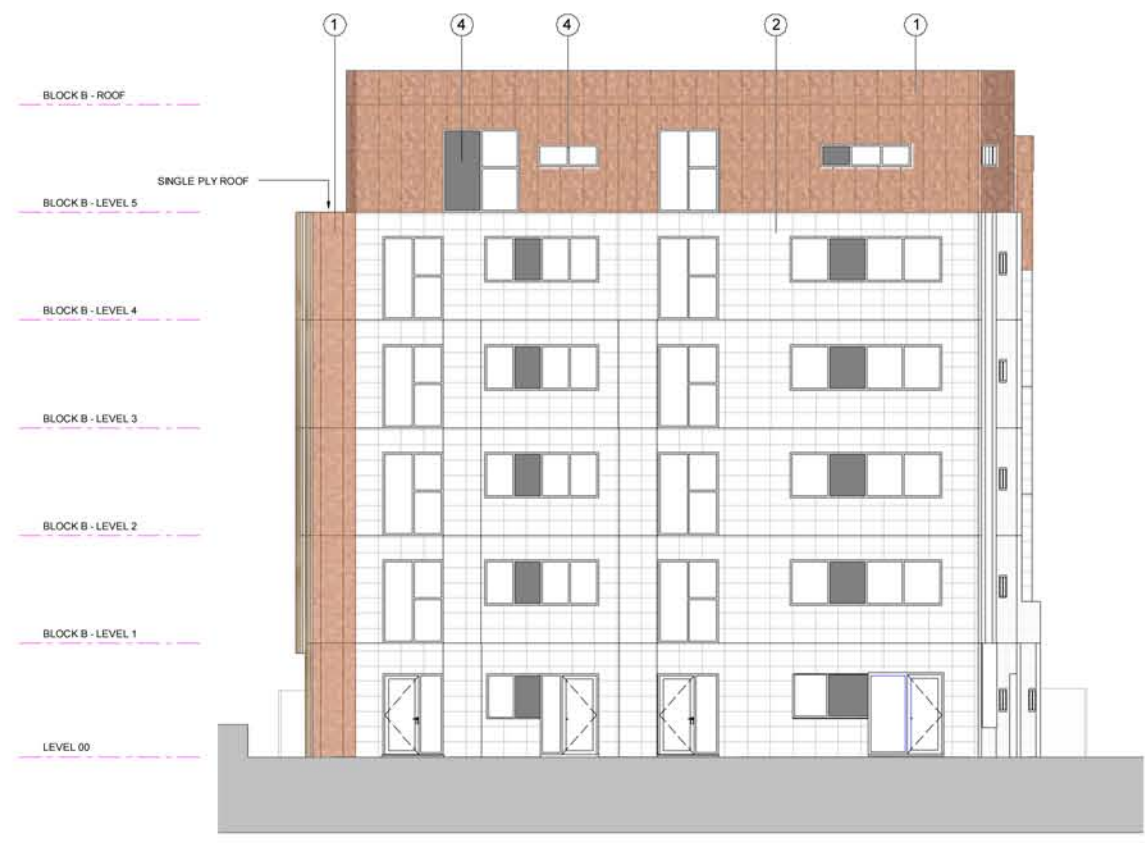
1 - PLANNING - NORTH ELEVATION 1 : 100