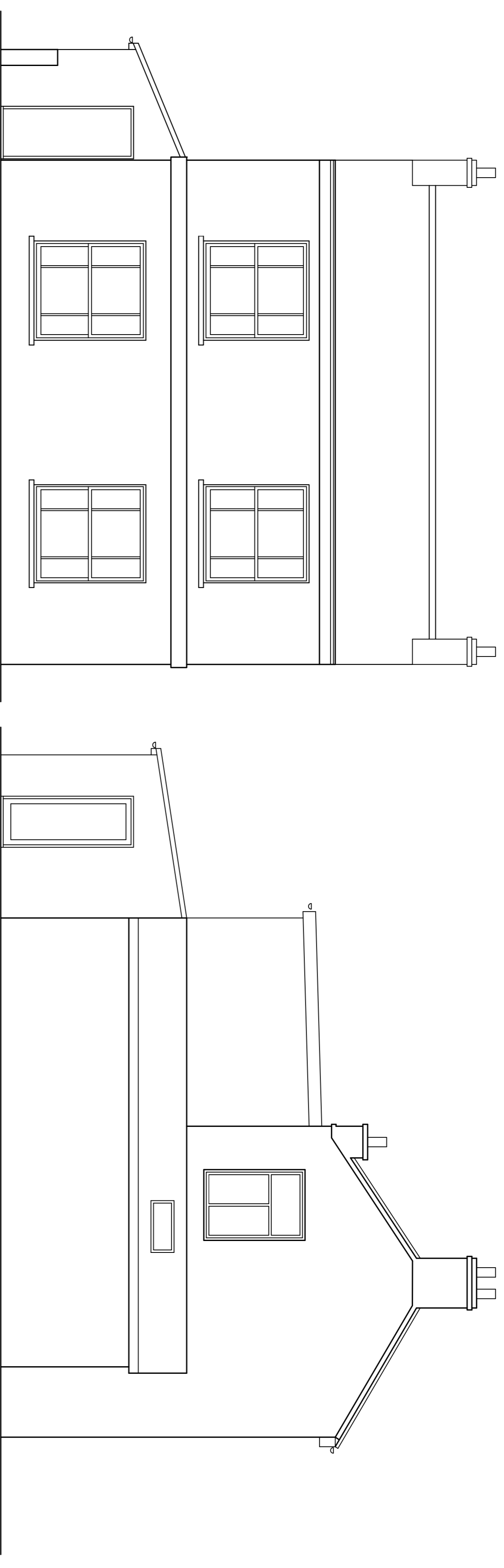
2 1:50 EXISTING