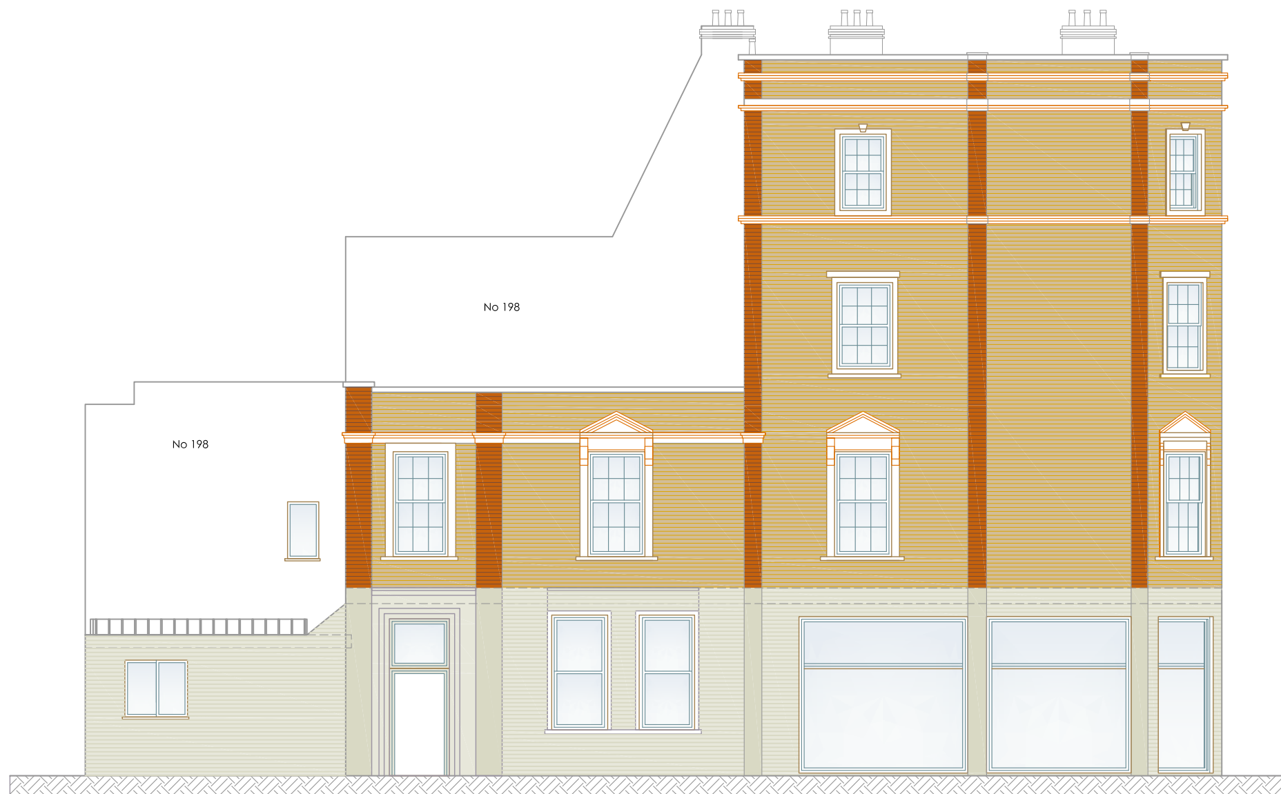
PLAN EXISTING SIDE ELEVATION Scale: 1:100 A3