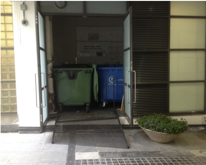
Bin Store at 34 Middlesex House

There is one collection of general waste per day and one collection of recycled waste per day.