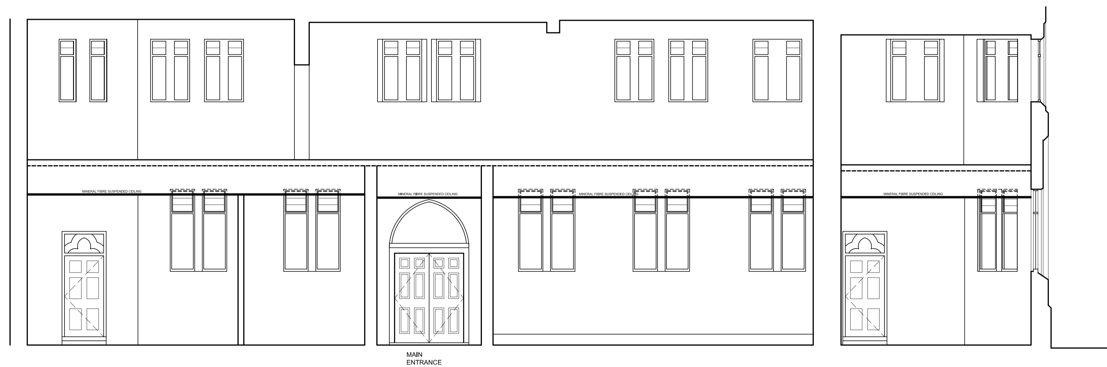
2 SECTION BB - LOOKING TOWARDS FRONT OF BUILDING 1:50