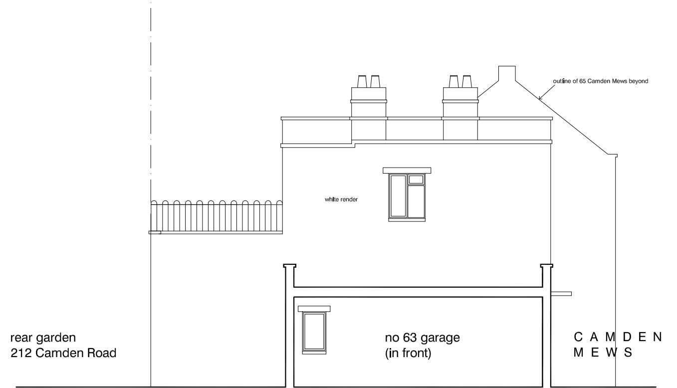
sw elevation as existing