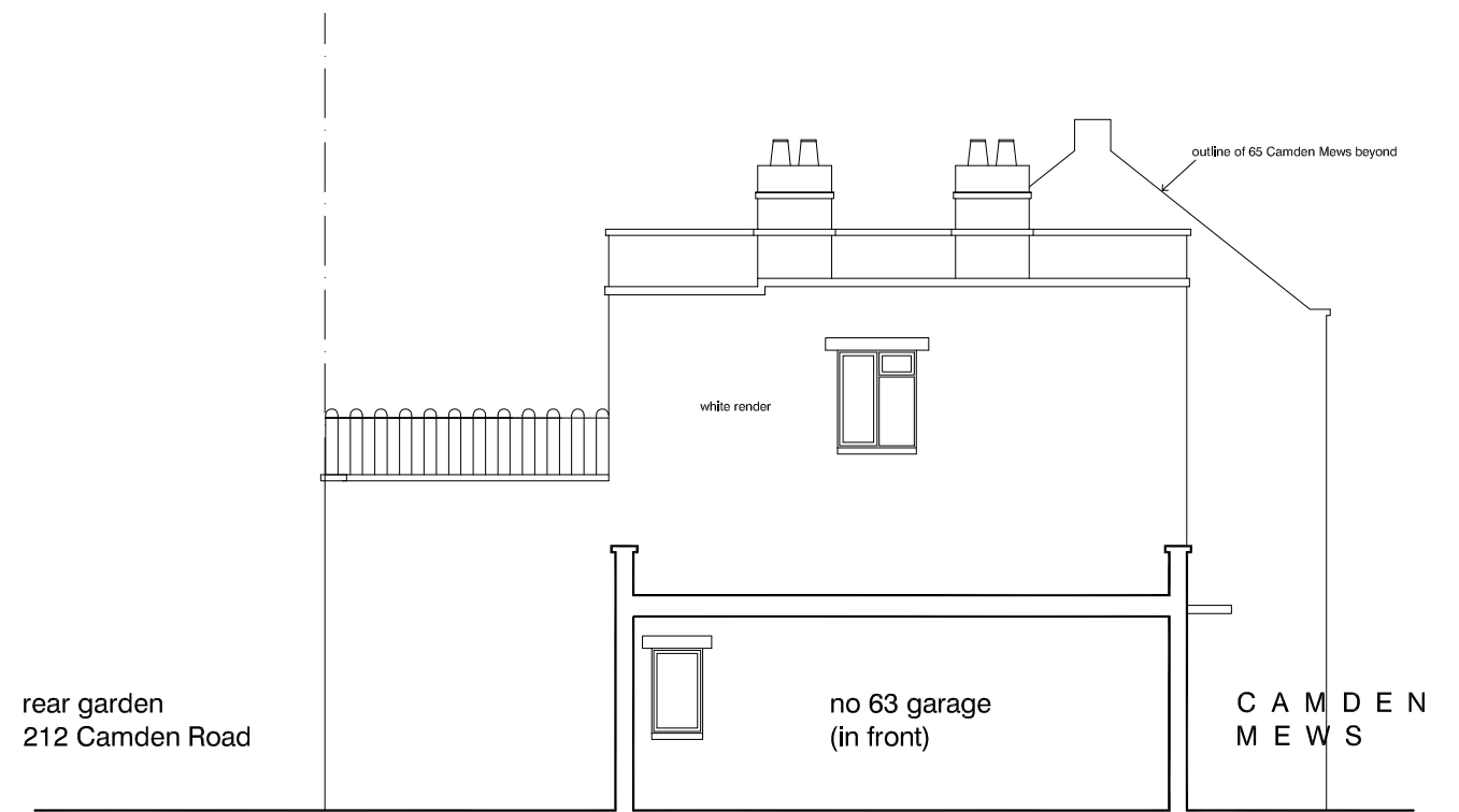
sw elevation as existing