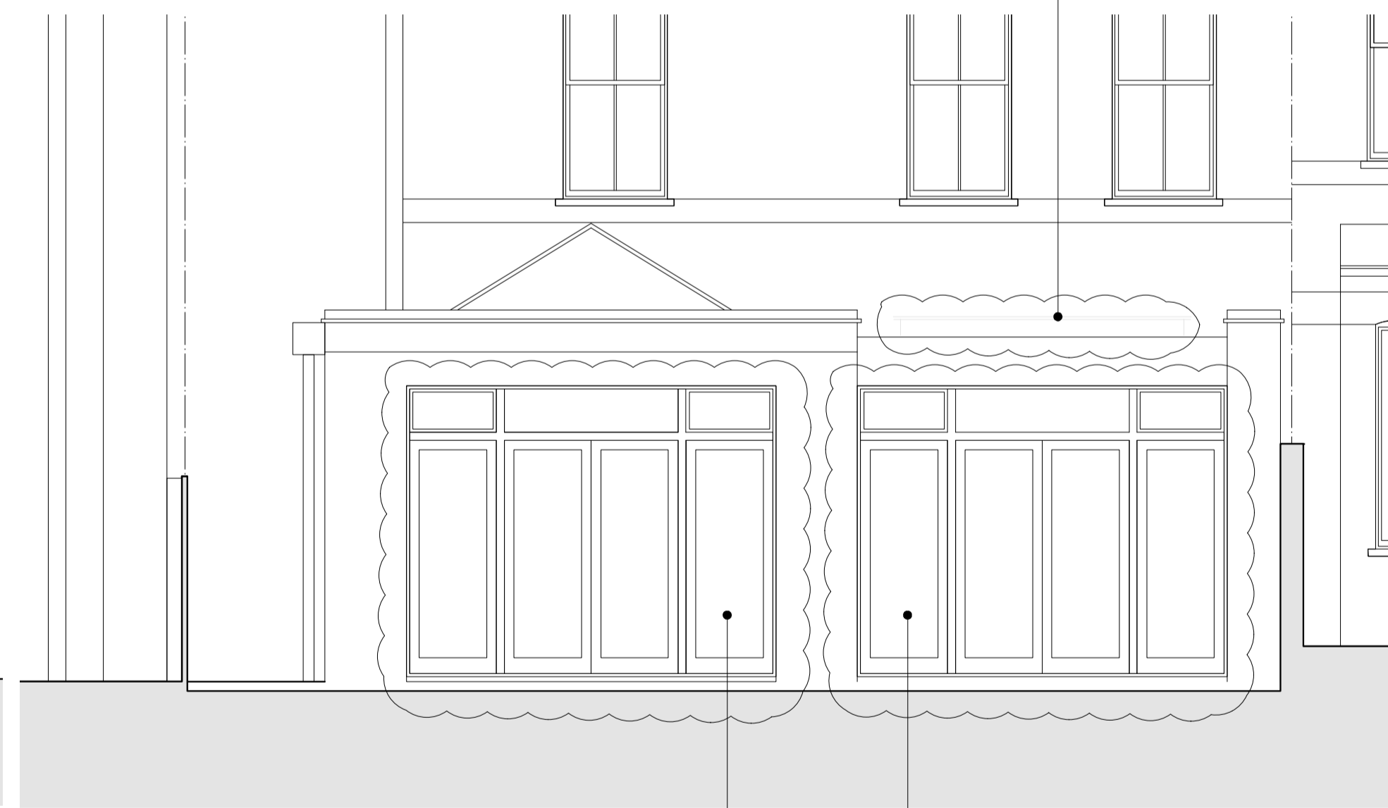
Proposed Rear Elevation (revised)