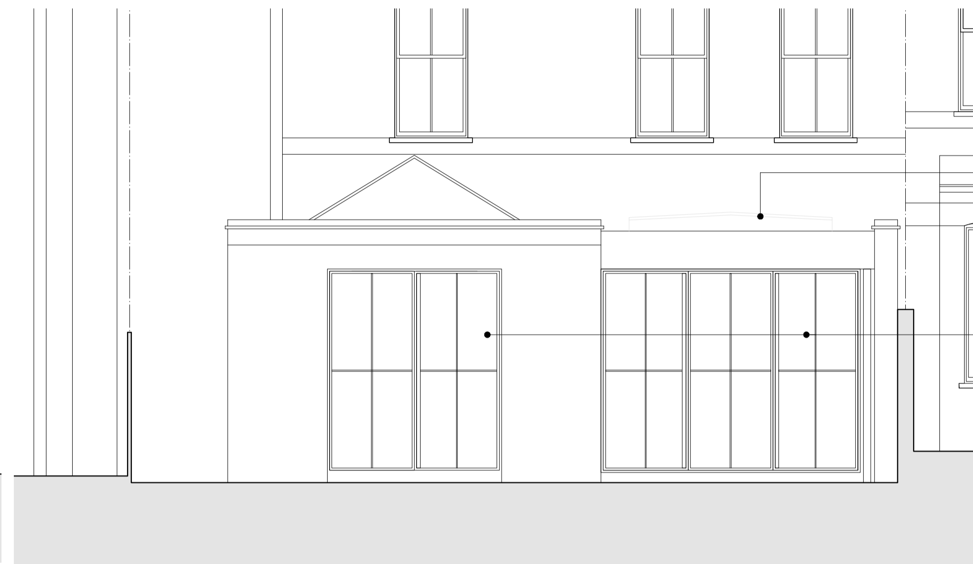
Proposed Rear Elevation (approved)

Low pitch rooflight (set back, refer plan) Steel framed windows and doors