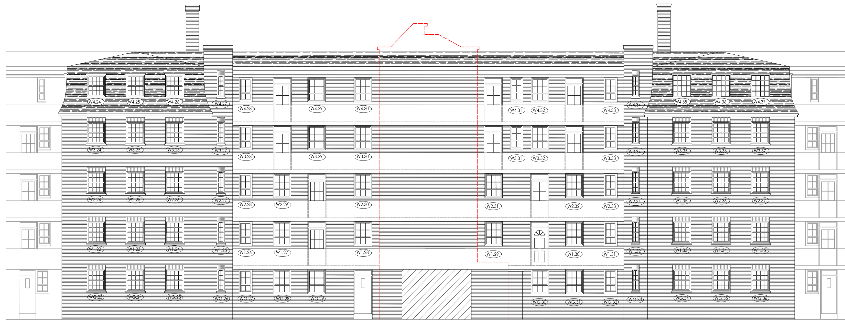
ELEVATION D (BEHIND TOWER)