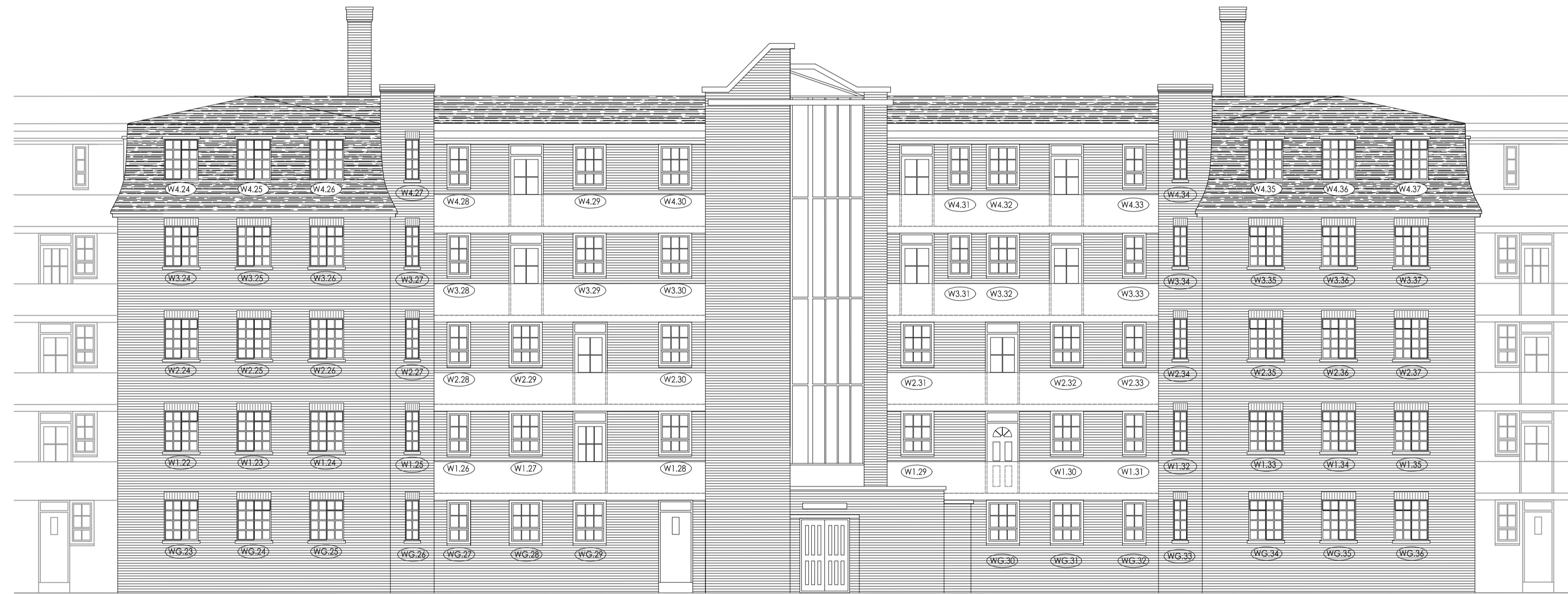
ELEVATION D (TOWER SHOWN)