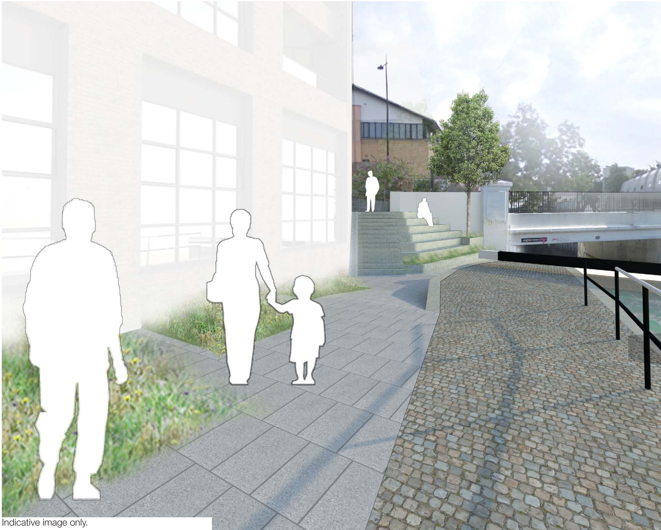
Indicative image only.

The area adjacent to the steps would benefit from increased passive surveillance and overlooking from the proposed Area E. The proposed seating area would reduce the existing dark and unsafe corners of the towpath, removing the need for the fence. The positioning of CCTV cameras would be reviewed in detail with a crime prevention officer and owner. Lighting would be integrated into the steps to avoid the need for pole mounted lights in this area.