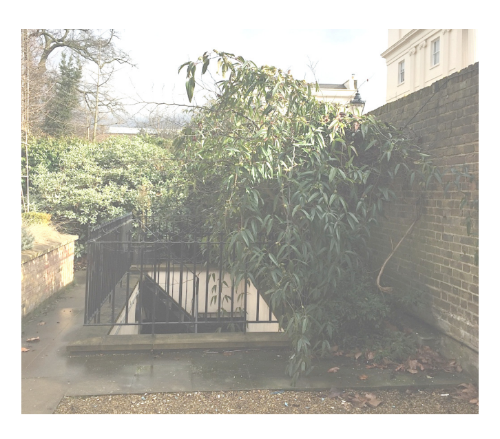
View of the far right corner of the garden where Shed is proposed to be located behind the dense plantation

The internal height of the shed would be approximately 2 meters. Its location is shown of drawing 831-PL.01