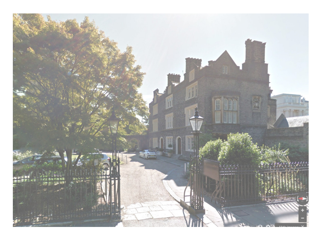
View of 1 St. Katherine's Precinct from Outer Circle

The area is a ten minute walk from Regent's Park tube station and the amenity of Regent's Park is across the road.