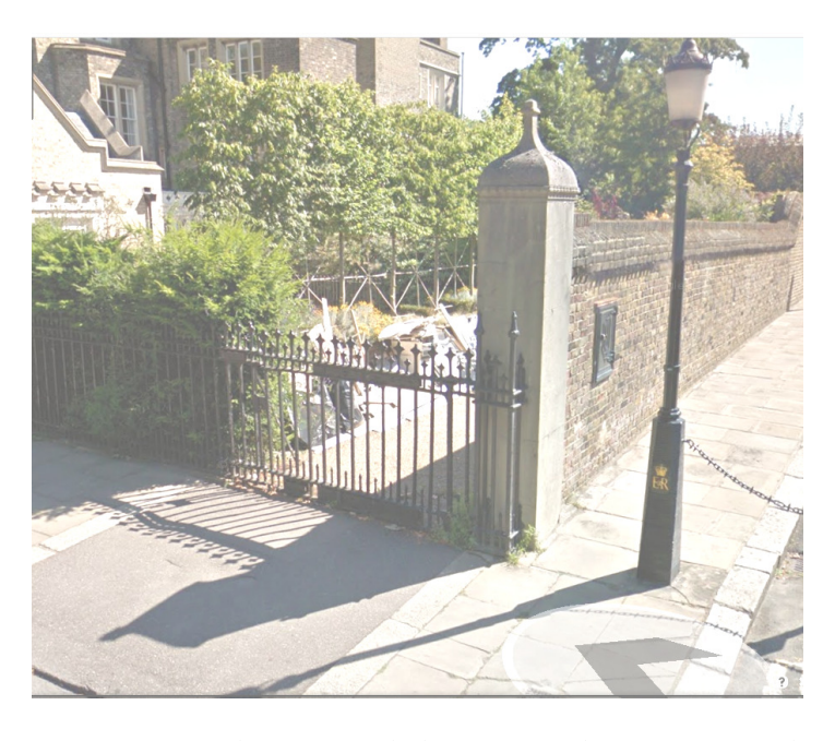
Existing Wrought Iron Single leaf gate in the perimeter railing

Currently a parking hard standing area is located behind a single swing opening in the perimeter railing.