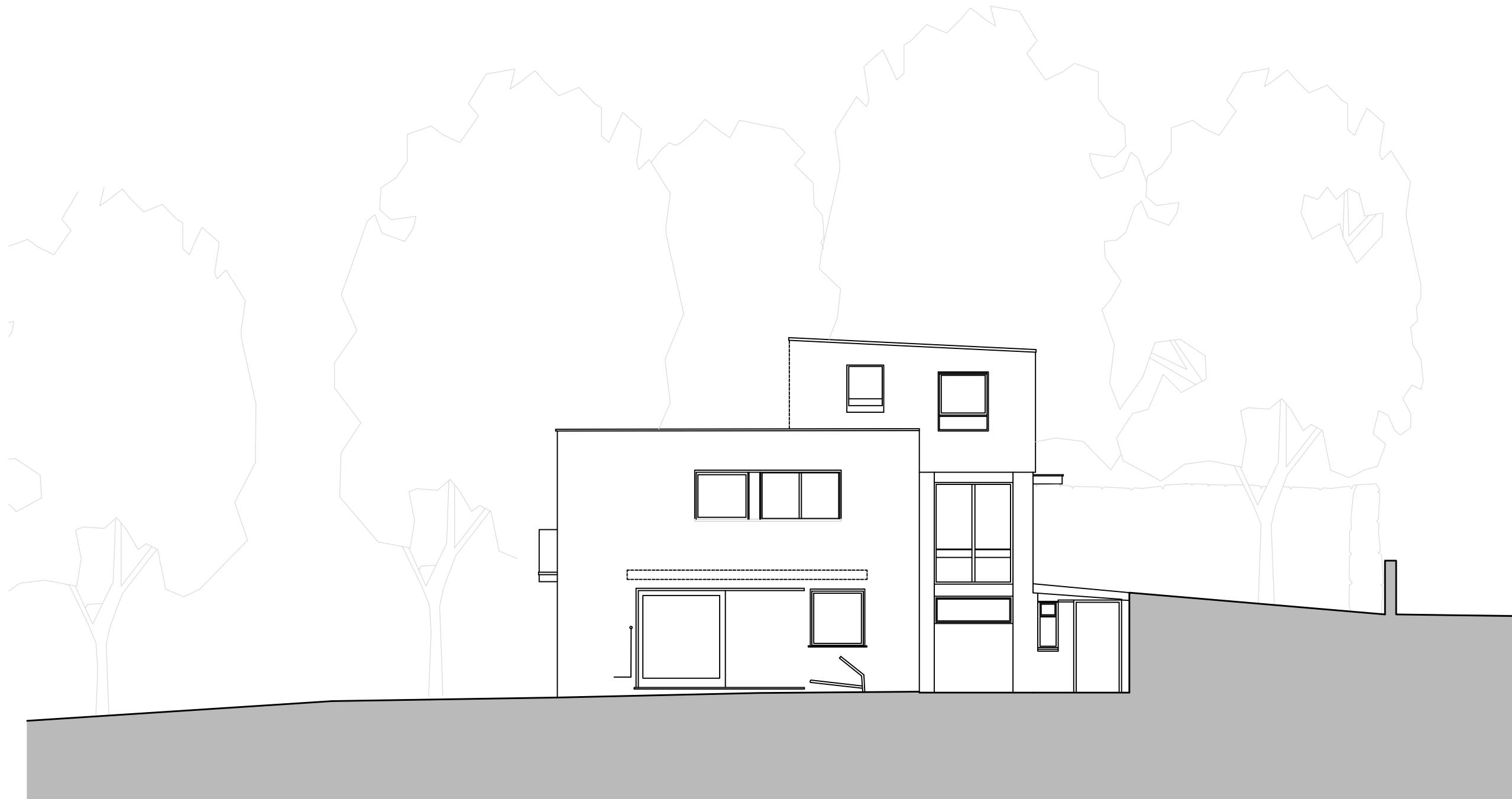
Existing Side Elevation Next to 55 (South)