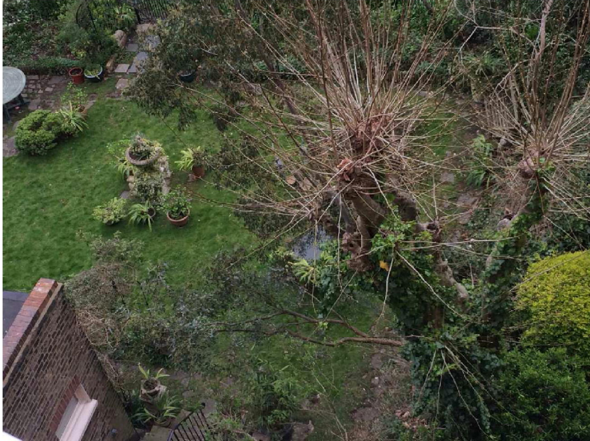
Corridor view – 1 st window