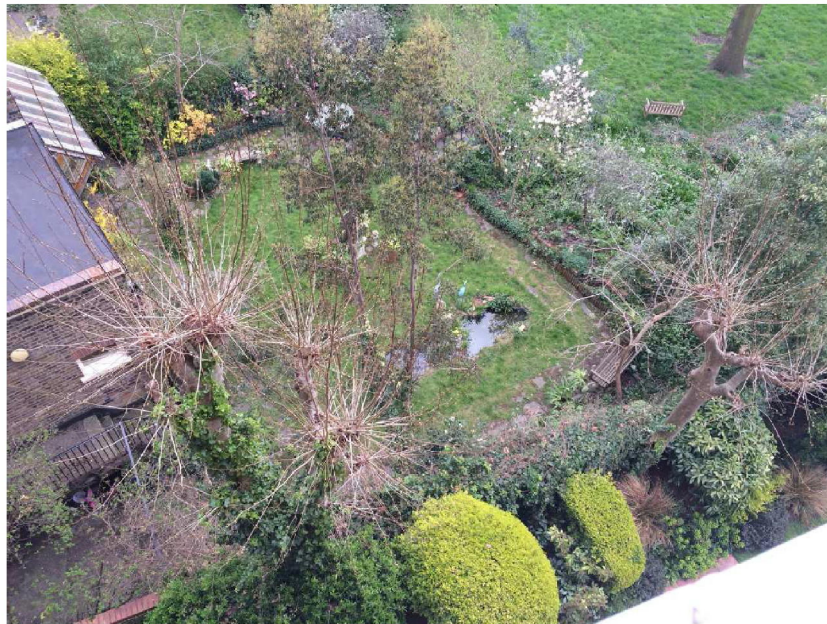
Corridor view – 3 rd window