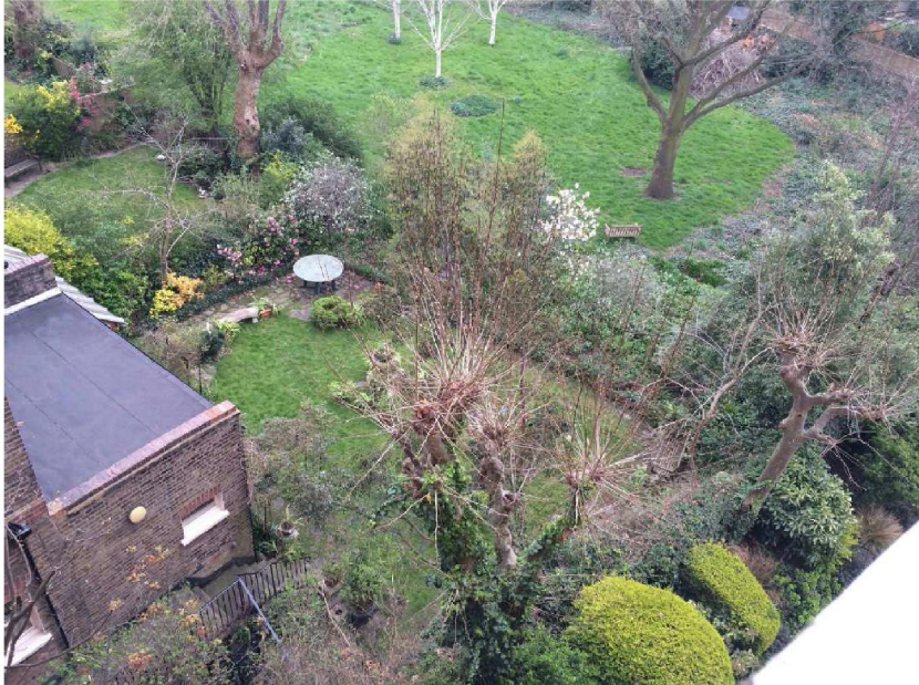
Corridor view – 2 nd window