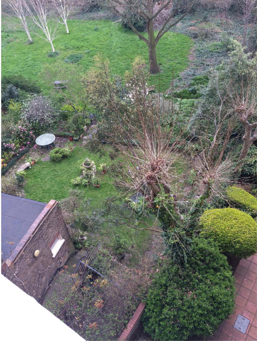
Bedroom 3 – Left window