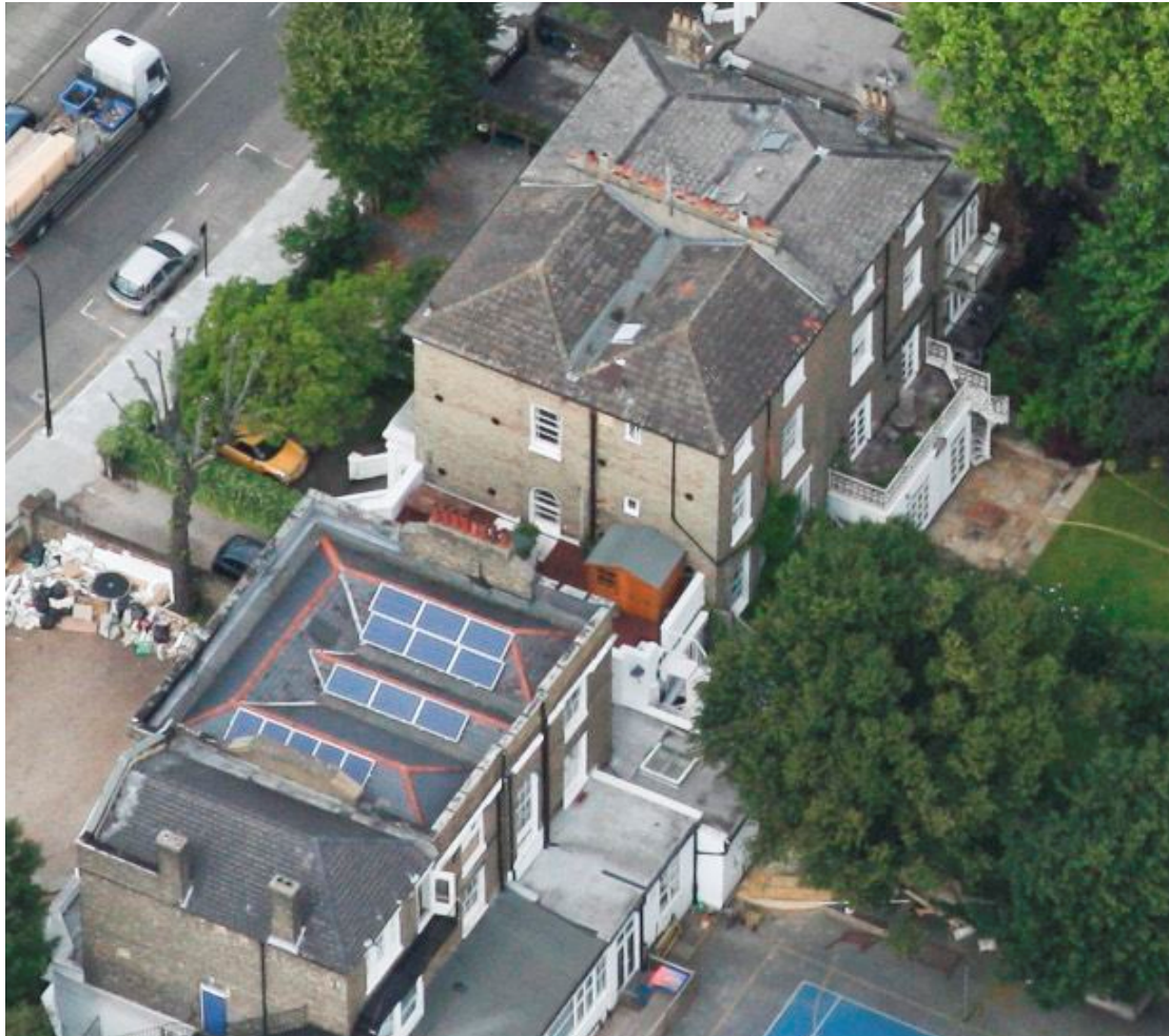
Ties inserted at first and second floor level

We subsequently carried out further internal strengthening because of concerns about building movement. All of this work was performed on the basis that the existing building at 4b was providing support to that side of our house. We are very concerned that if the building is demolished and a substantial excavation is carried out below a wall that we know is old and prone to movement that there is a real risk of building collapse.