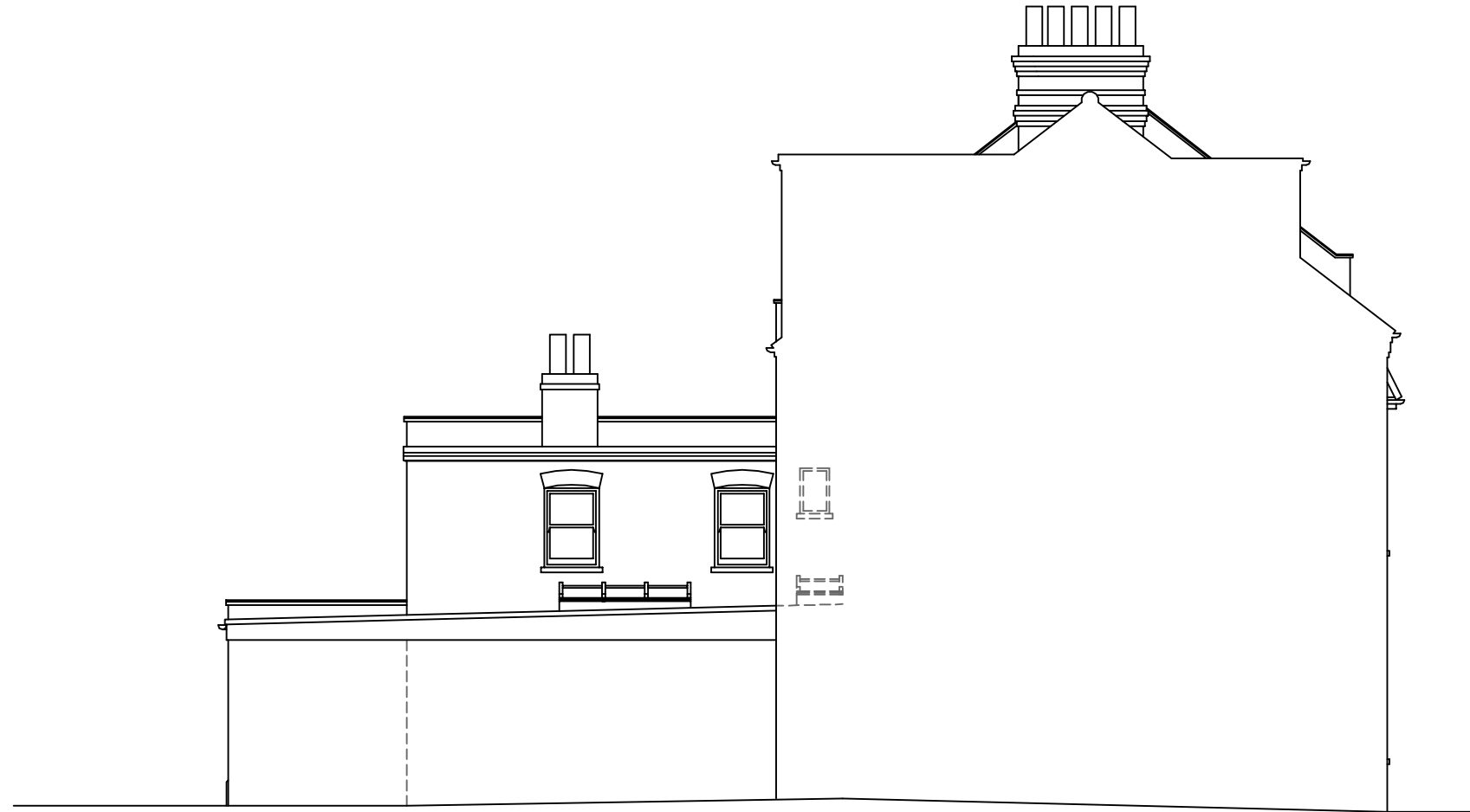
SIDE ELEVATION (NE)