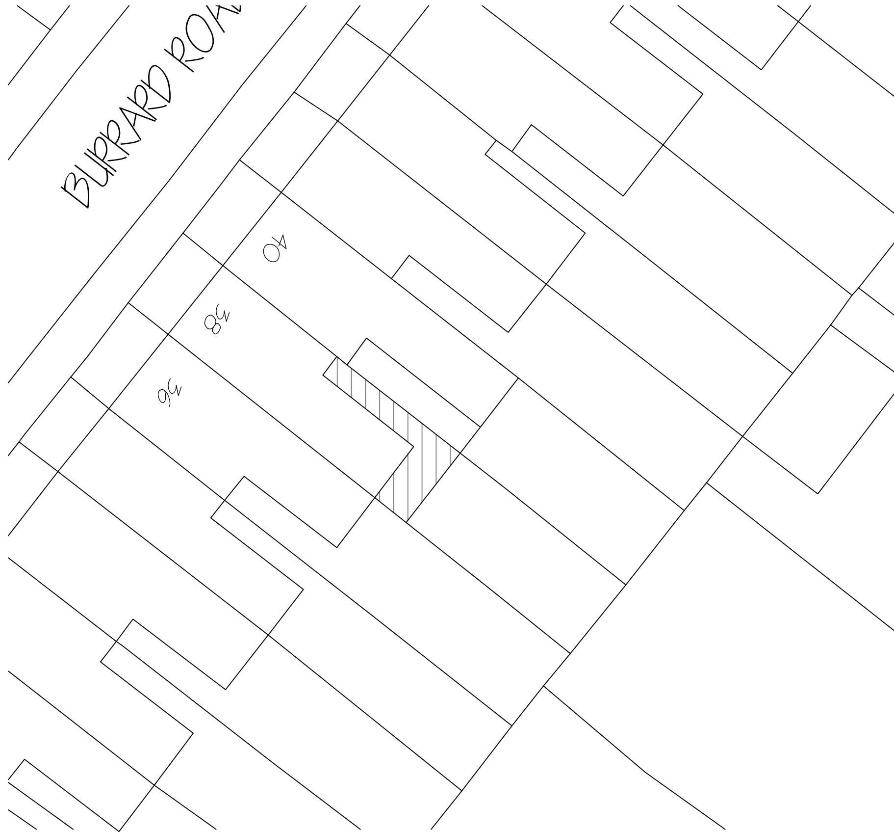
BLOCK PLAN ~ 1:200