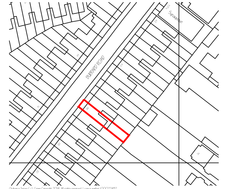
LOCATION PLAN ~ 1:1250