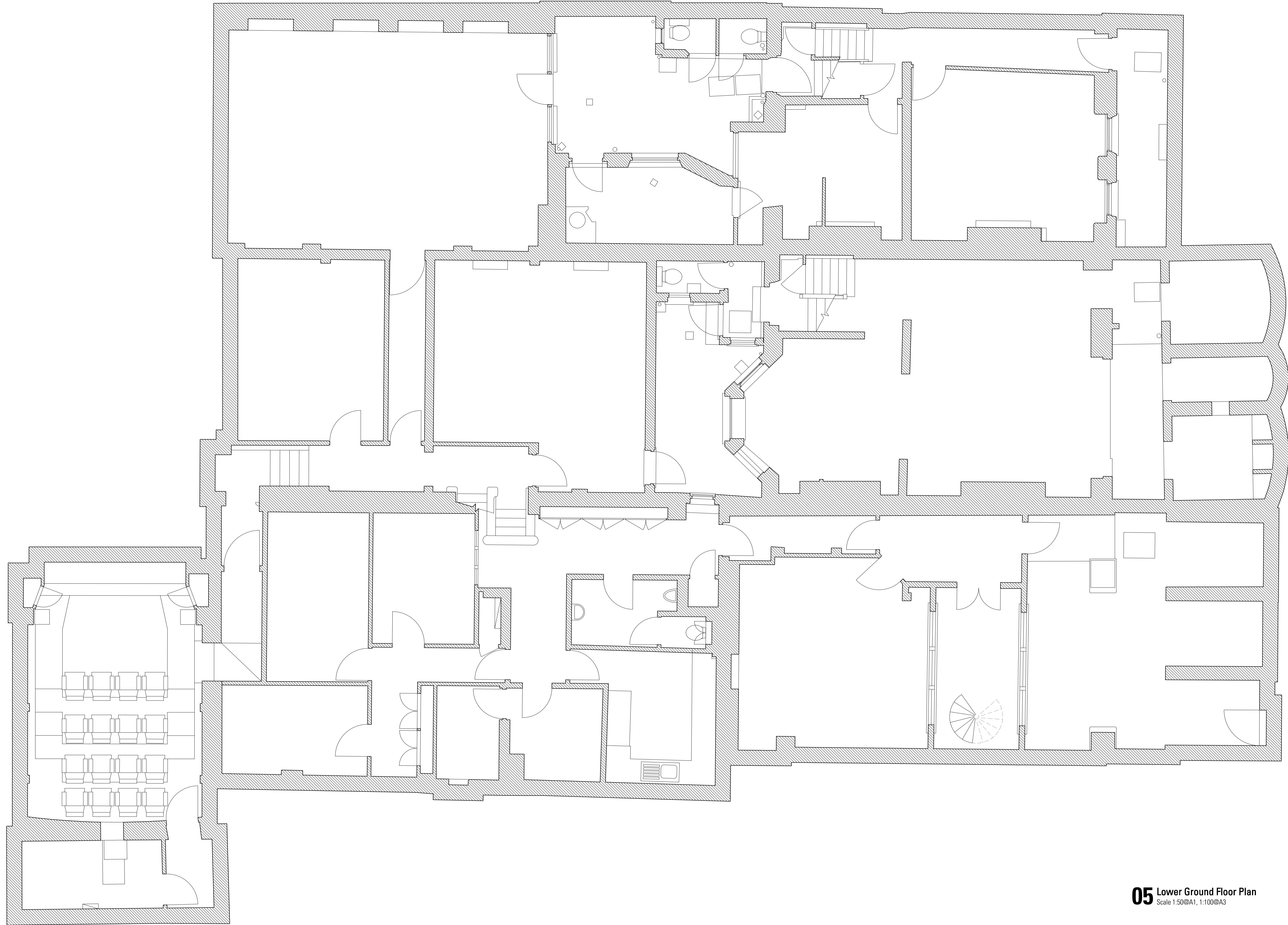
05 Lower Ground Floor Plan Scale 1:50@A1, 1:100@A3