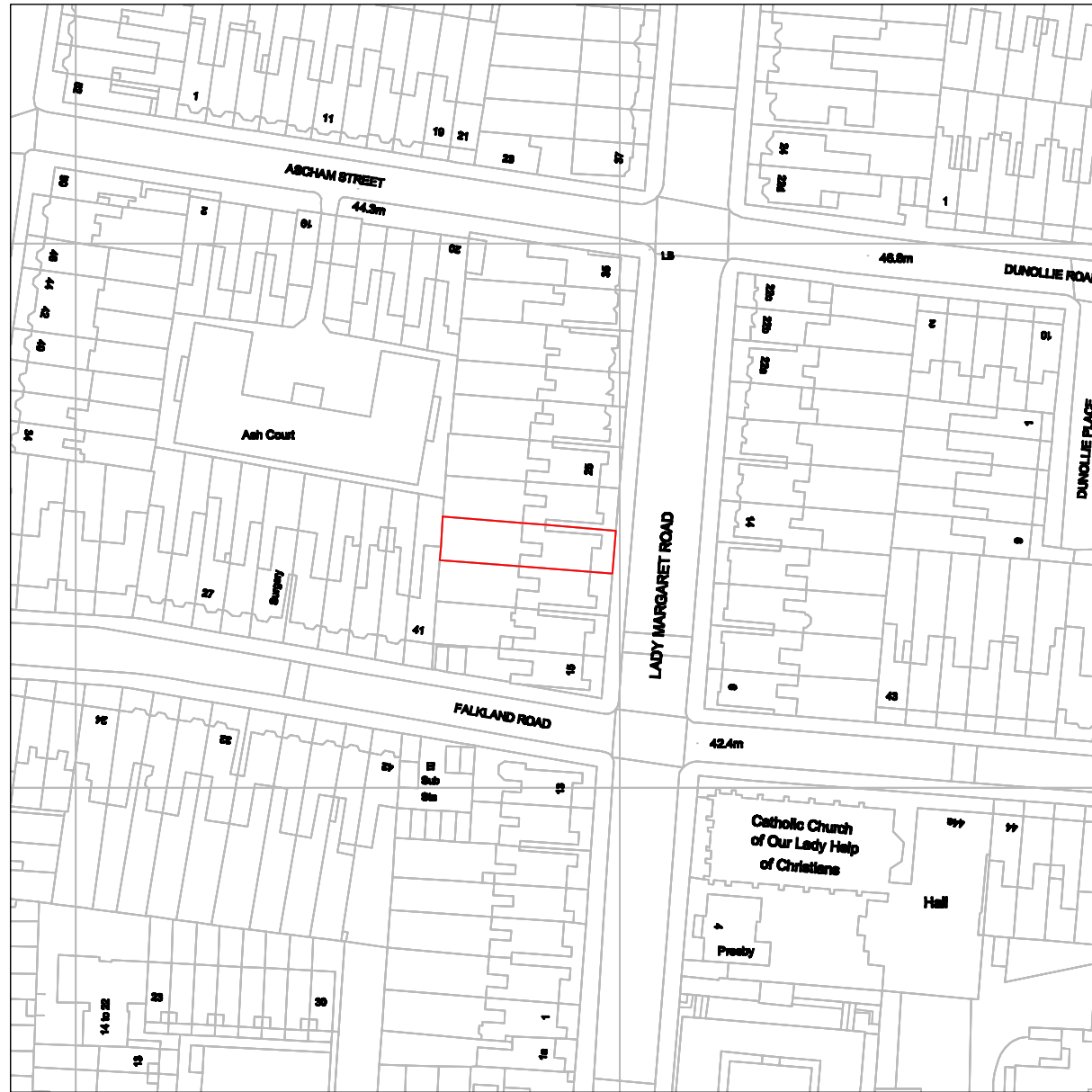
Location plan - 1:1250