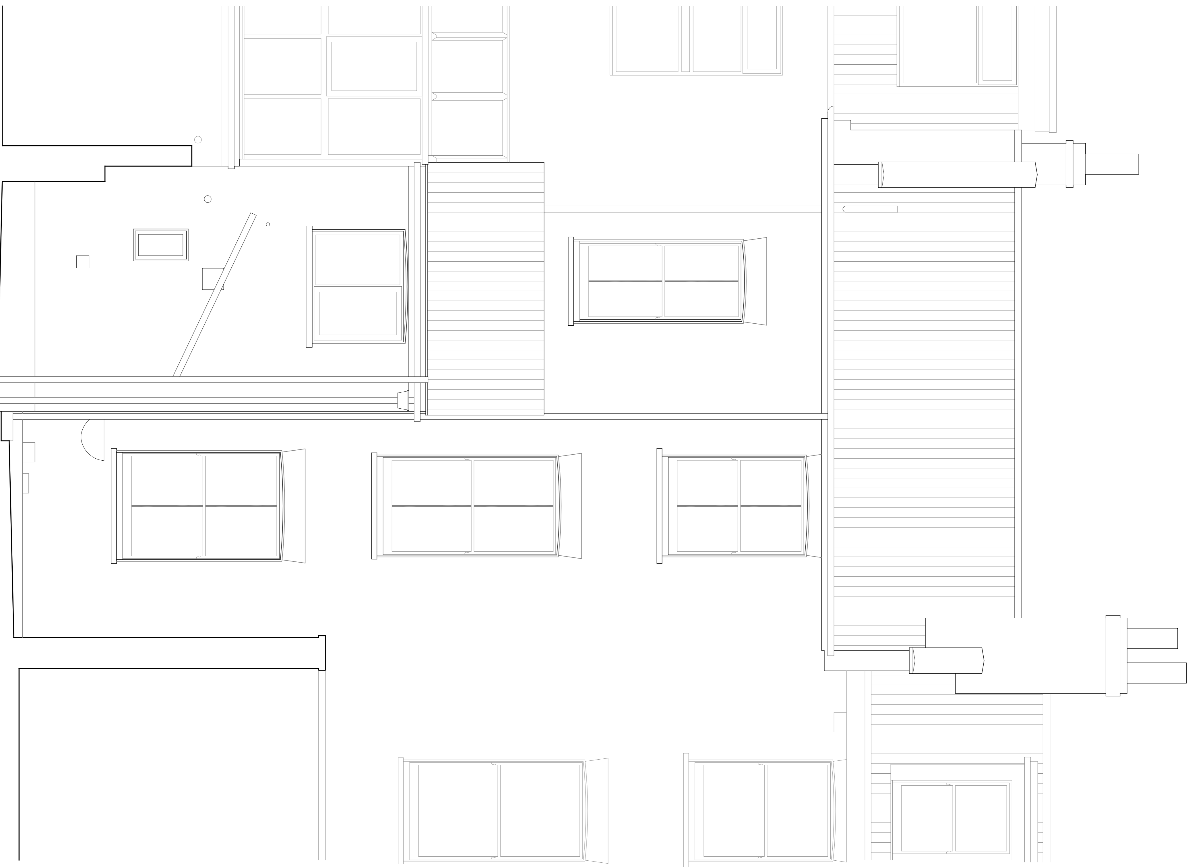
EXISTING Rear Elevation SCALE 1/50@A3 EX-06